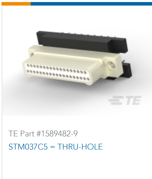
TE Part #1589482-9 STM037C5 = THRU-HOLE