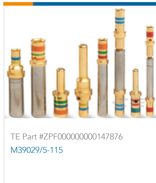
TE Part #ZPF00000000147876 M39029/5-115