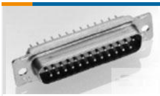
TE Part #1757820-2 AMPLIMITE,ASY,RCPT,STD,109,ZN,2