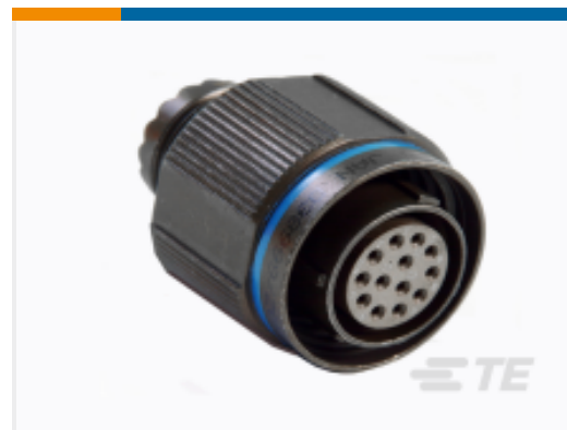
TE Part #YDTS26Z19-32PNV001 D38999: Straight Plug, 19-32 Insert