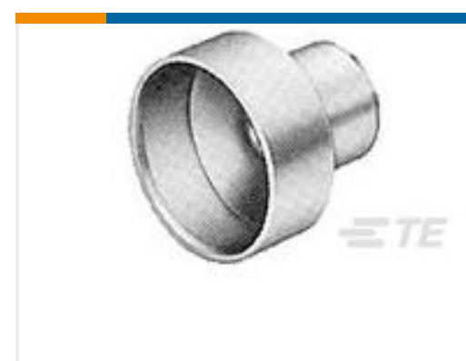
TE Part #3-747579-2 SHLDNG FERRULE, PLTD, BULK PKG