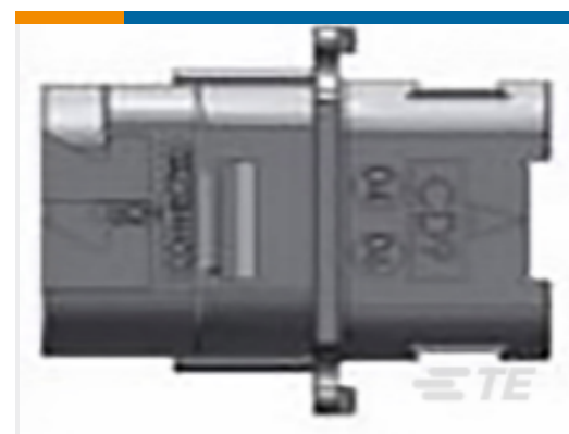
TE Part #ZPF000000000146190 DMC-MD 26 A-K-T