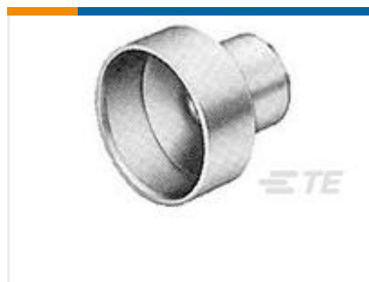
TE Part #3-747579-0 SHLDNG FERRULE, PLTD, BULK PKG