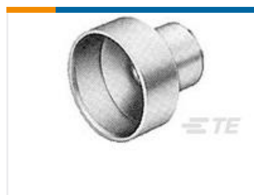
TE Part #3-747579-4 SHLDNG FERRULE, PLTD, BULK PKG