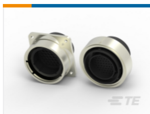
TE Part #208714-1 CMC SERIES 1