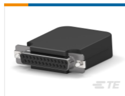
TE Part #1658649-1 D-Sub Crimp Recept Signal 25 Posn, Socket Size 20, Shell Size 3