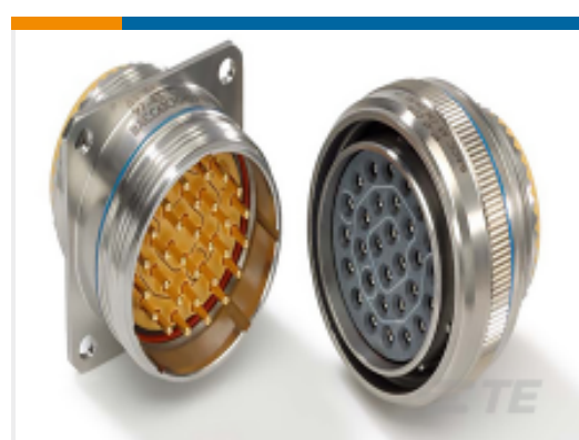
TE Part #ZPF000000000007816 983-0Y 12-03 PN