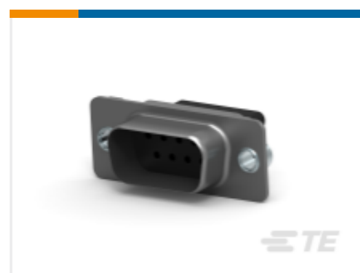
TE Part #1658645-1 D-Sub Crimp: Plug, Signal, 9 Posn, Pin Size 20, Shell Size 1