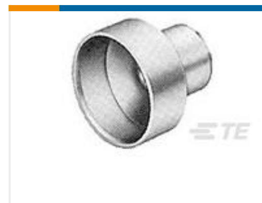
TE Part #3-747579-0 SHLDNG FERRULE, PLTD, BULK PKG