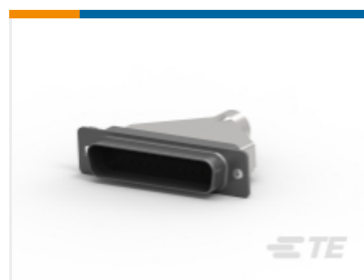
TE Part #1658648-1 D-Sub Crimp: Plug, Signal, 25 Posn, Pin Size 20, Shell Size 3