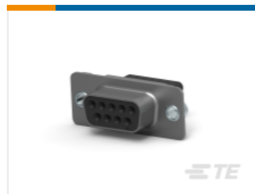
TE Part #1658646-1 D-Sub Crimp Recept Signal 9 Posn, Socket Size 20, Shell Size 1