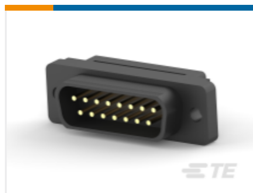
TE Part #1658608-2 IDC D-Sub: Plug Assembly, Low Profile, Signal, 2.77 mm