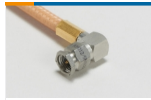
RF Cable Assemblies(2)