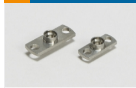
RF Connector Shrouds(10)