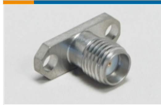
RF Connector Launchers(13)