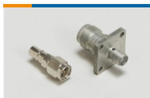
Between Series Adapters(3)