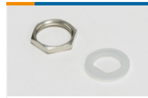
RF Connector Hardware(2)