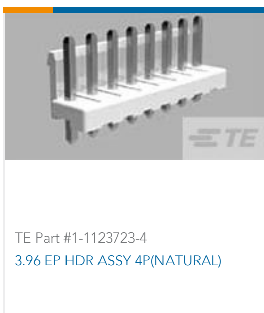
TE Part #1-1123723-4 3.96 EP HDR ASSY 4P(NATURAL)