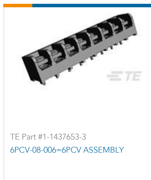
TE Part #1-1437653-3 6PCV-08-006=6PCV ASSEMBLY