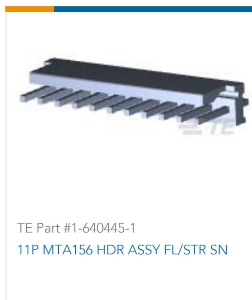
TE Part #1-640445-1 11P MTA156 HDR ASSY FL/STR SN