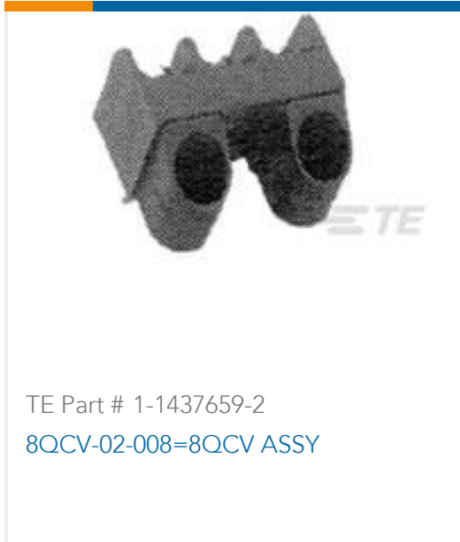
TE Part # 1-1437659-2 8QCV-02-008=8QCV ASSY