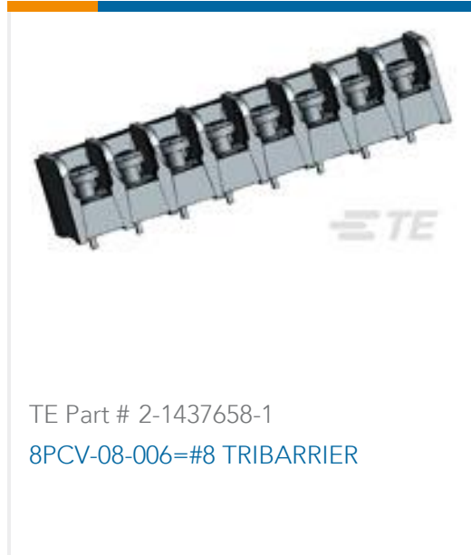
TE Part # 2-1437658-1 8PCV-08-006=#8 TRIBARRIER