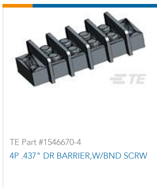
TE Part #1546670-4 4P .437" DR BARRIER,W/BND SCRW