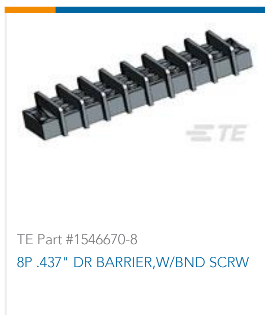
TE Part #1546670-8 8P .437" DR BARRIER,W/BND SCRW