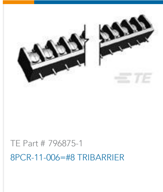
TE Part # 796875-1 8PCR-11-006=#8 TRIBARRIER