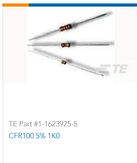
TE Part #1-1623925-5 CFR100 5% 1K0