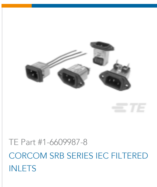
TE Part #1-6609987-8 CORCOM SRB SERIES IEC FILTERED INLETS