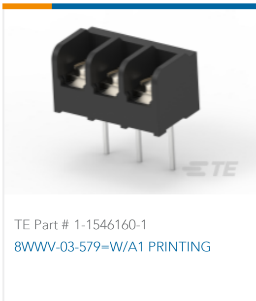
TE Part # 1-1546160-1 8WWV-03-579=W/A1 PRINTING