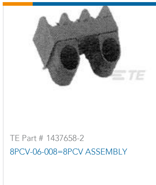
TE Part # 1437658-2 8PCV-06-008=8PCV ASSEMBLY