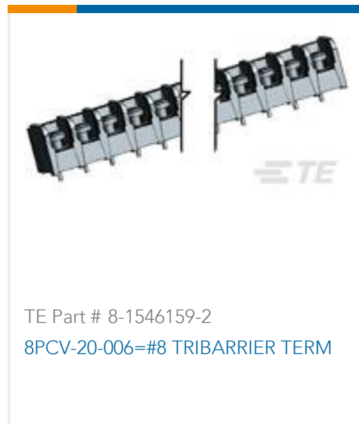
TE Part # 8-1546159-2 8PCV-20-006=#8 TRIBARRIER TERM