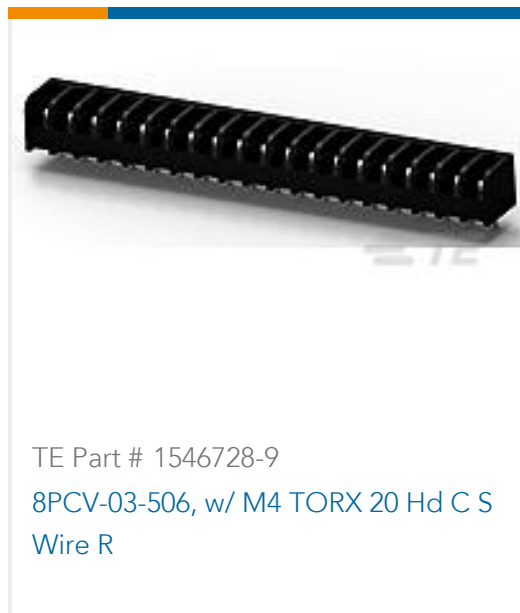
TE Part # 1546728-9 8PCV-03-506, w/ M4 TORX 20 Hd C S Wire R