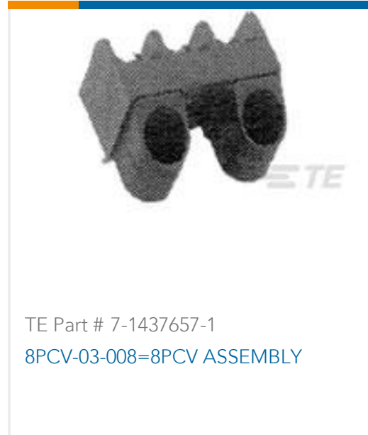
TE Part # 7-1437657-1 8PCV-03-008=8PCV ASSEMBLY