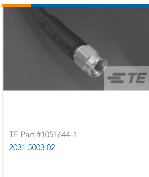
TE Part #1051644-1 2031 5003 02