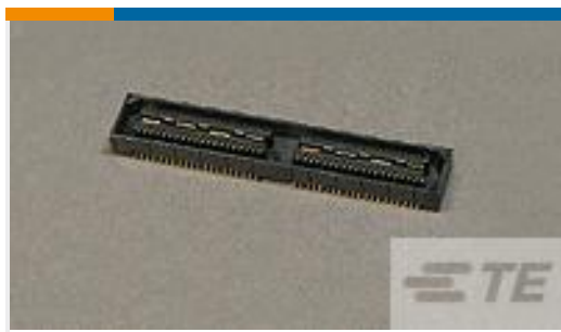
TE Part #6-1658043-2 MSB0.80RC-ASY080FL,GP,F,-TR