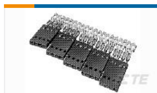
TE Part #103975-4 4X5 MTE RCPT SR PLAIN .100CL