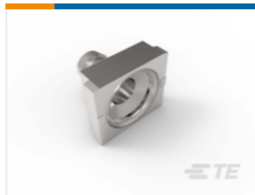
TE Part #1-2308348-3 CRIMP FLANGE FOR SIZE 4-5STD /5QL SHELL