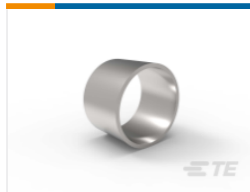
TE Part #1-2308350-6 CRIMP BARREL