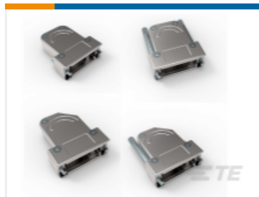
TE Part #1-2308341-5 D-SUB BACKSHELL SIZE 2