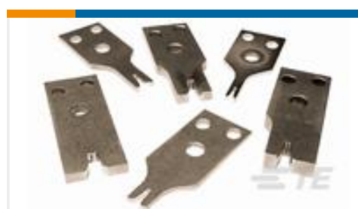
TE Part #1-456135-2 CRIMPER INSULATION O