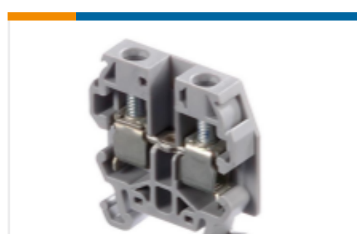
TE Part #1SNA110491R1700 DR4/6.1