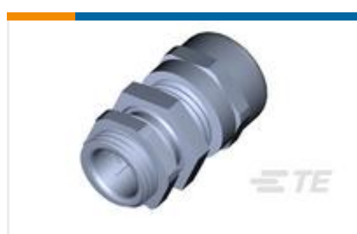
TE Part #1478884-2 Metric EMC Gland M16x1.5