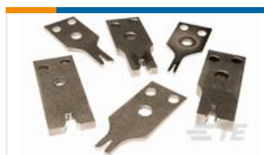
TE Part #1-683453-2 CRIMPER, INSUL 'F'