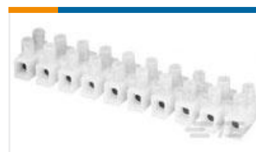
TE Part #1546301-3 TSB1000 03MDS=12MM W/WIRE STOP