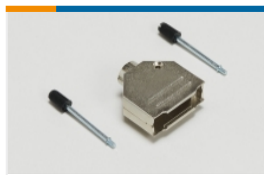
D-Sub Backshells &amp; Clamps(143)