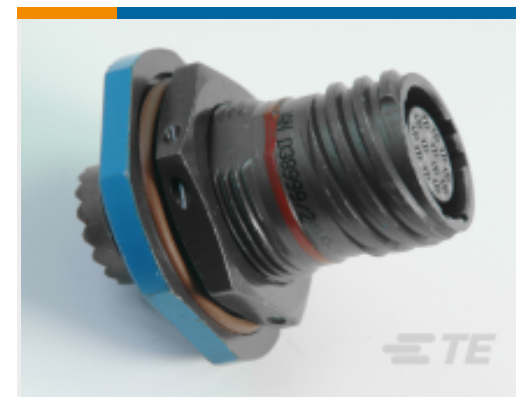
TE Part #YDTS24F15-35ANV001 D38999: Jam Nut, 15-35 Insert, Electroless Nickel Plating