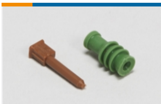
Automotive Seals & Cavity Plugs(6)