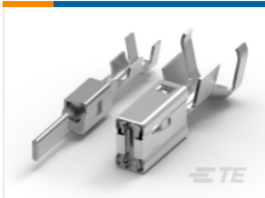
TE Part # CAT-AM705-T273 AMP MCP, RECEPTACLE AND TAB