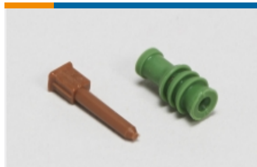
Automotive Seals & Cavity Plugs(3)