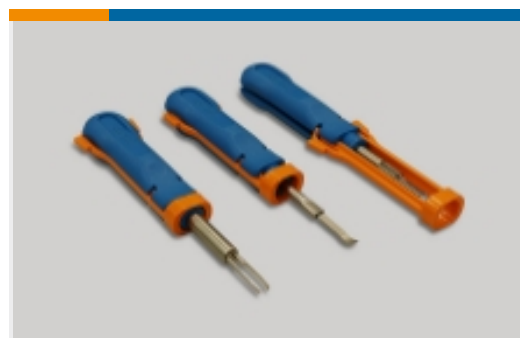
Insertion & Extraction Tools(13)