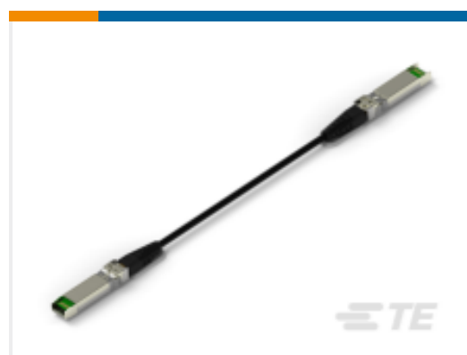
TE Part # CAT-C11-N4901142 SFP28 to SFP28 Cable Assembly: 32 AWG