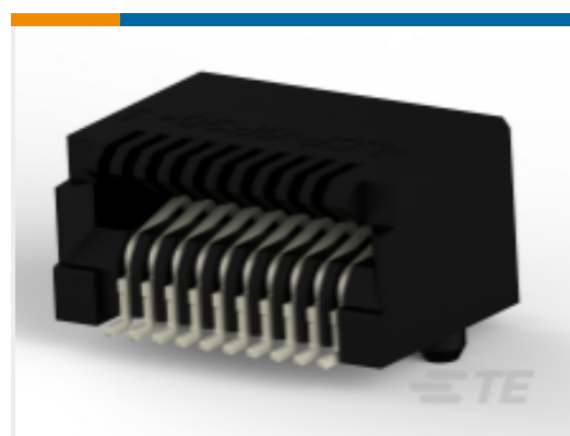
TE Part # CAT-SF59-C76264 SFP Connectors