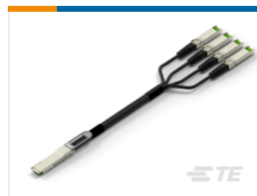
TE Part # CAT-C11-N490333 QSFP28-Four SFP+ Cable Assembly: 30 AWG