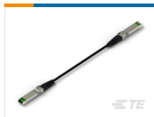
TE Part # CAT-C11-N4901114 SFP28 to SFP28 Cable Assembly: 30 AWG