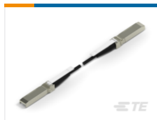
TE Part # CAT-C11-H50626 SFP+ to SFP+ I/O Cable Assembly: 30 AWG