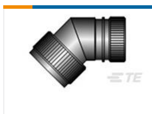
TE Part #CZ6862-000 HEX40-AC-45-25-A12-3