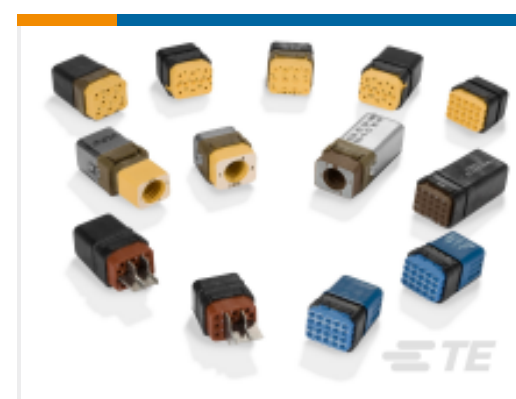
TE Part #ZPF00000000015141 DMC-M 01-08 AB