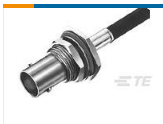
TE Part #225398-6 CONNECTOR, BNC DUAL CRIMP JACK