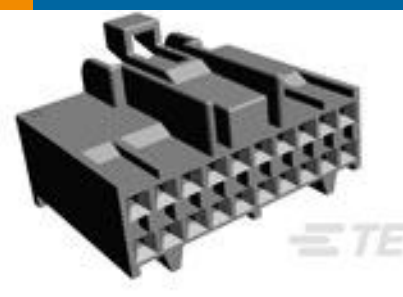
TE Part #172047-2 DLI HSG 20 POS MOD IV TYPE