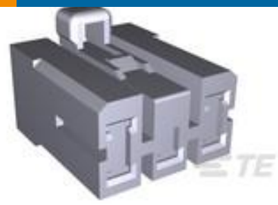
TE Part #172494-1 MIC MARK-2 PLUG HSG 5P