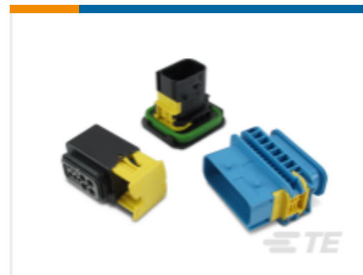
TE Part # CAT-H3399-CH8172 HEAVY DUTY SEALED CONNECTOR HOUSINGS