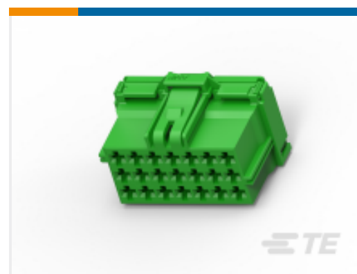
TE Part #1-2112890-3 AMP MCP, UNSEALED CONNECTOR HOUSING