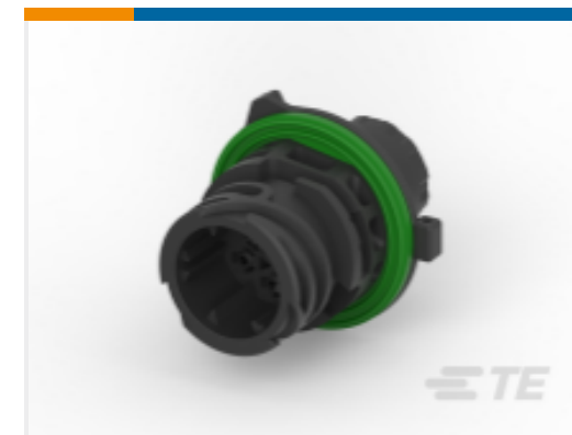
TE Part # 1718230-1 1,5MM PIN HSG 5-7 POS ASSY