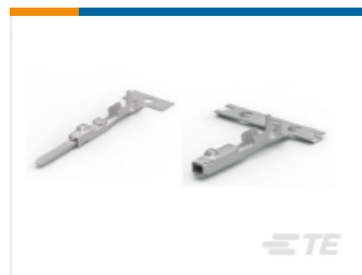
TE Part #1-1823034-1 MCON, RECEPTACLE AND TAB