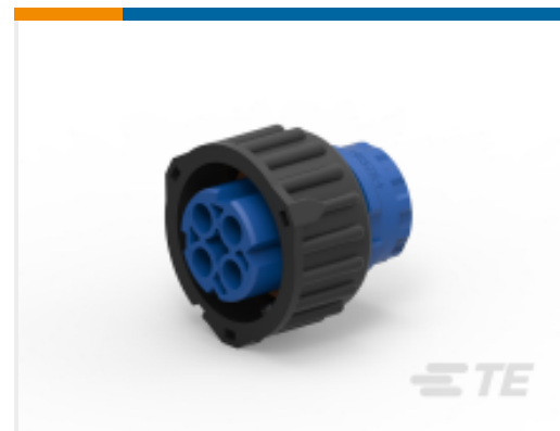
TE Part # 4-967325-1 2,5MM BU-GEH 4P,BL