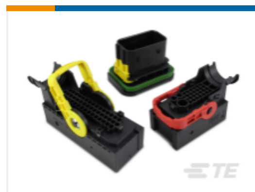
TE Part #1-2112041-2 LEAVYSEAL HOUSINGS