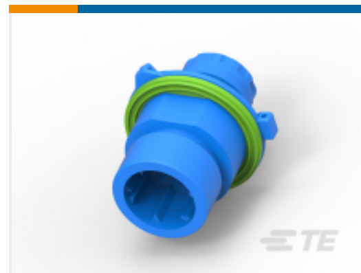
TE Part # CAT-C4962-CH8172 CIRCULAR DIN HOUSINGS