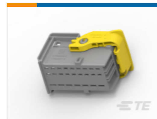
TE Part #1-2141846-3 AMP MCP BACKSHELLS