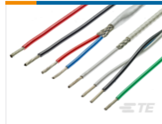
TE Part #265110-000 44A0811-0-0