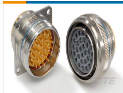
TE Part #ZPF000000000033177 983-0S 10-05 S6