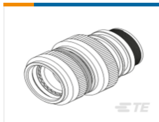
TE Part #E67325-000 STXR40AU00-1216BI