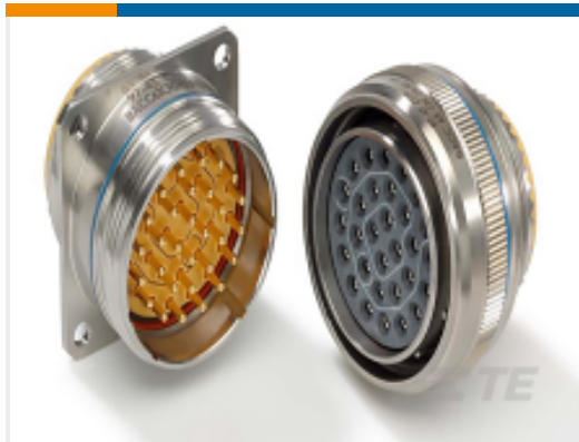
TE Part #ZPF000000000007324 983-0S 10-05 PN