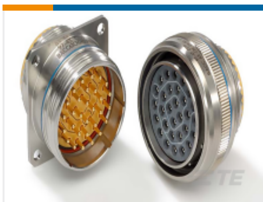
TE Part #ZPF000000000007308 983-0S 08-03 PN