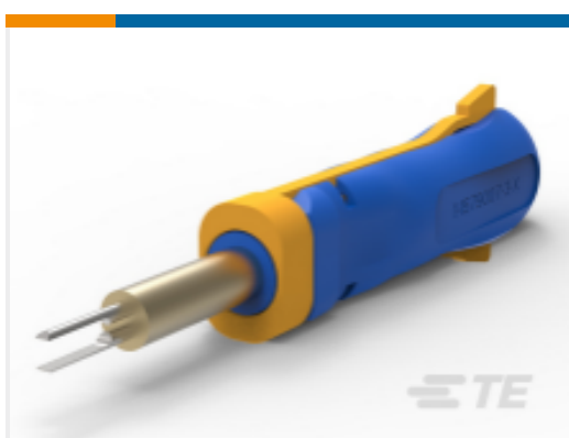
TE Part # 1-1579007-3 EXTRACTION TOOL