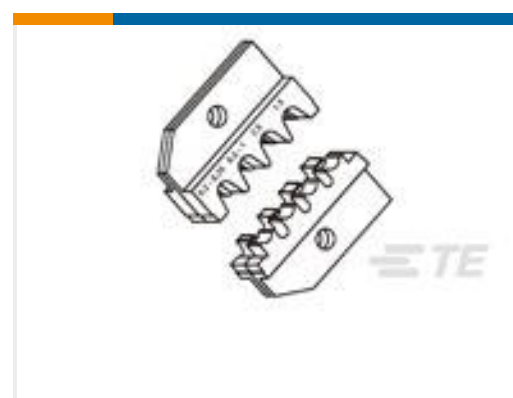
TE Part # 539954-2 ERGO DIE MCP 4,8K