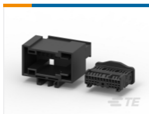
TE Part # CAT-M8793-CH8172 MQS, CONNECTOR HOUSING