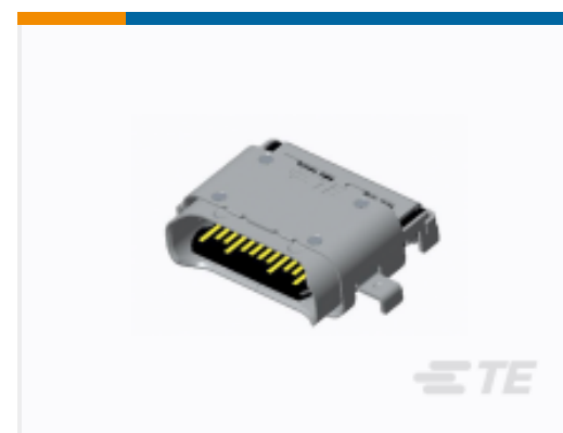
TE Part #1-2295018-2 USB TYPE C, REC OFFSET 0.65MM DUAL SMT