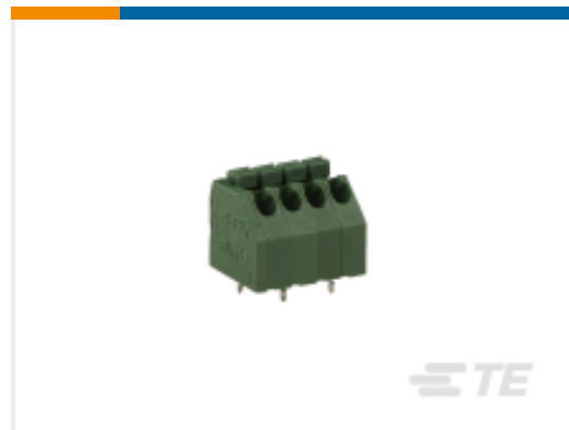
TE Part #1-2834011-4 4POS 3.5MM TOP ENTRY SCREWLESS CONN.