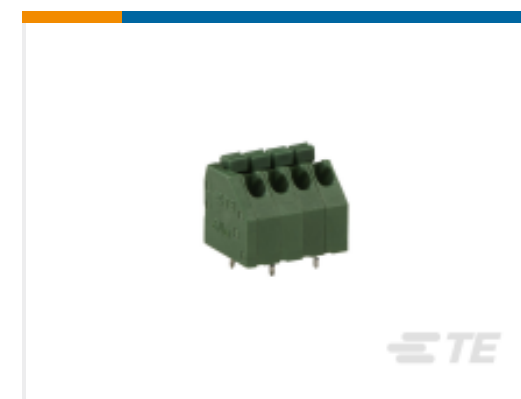
TE Part #1-2834011-3 3POS 3.5MM TOP ENTRY SCREWLESS CONN.