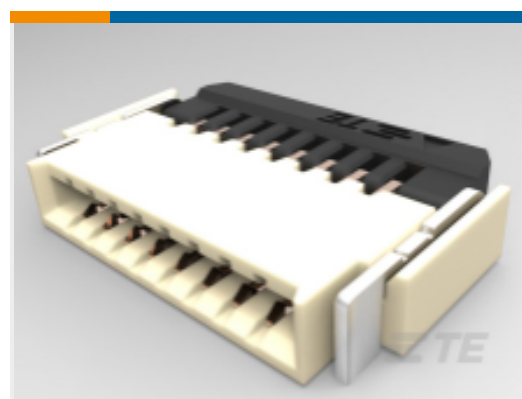
TE Part #1-2328702-0 10PIN 0.5MMP FPC CONN, BACK FLIP LOCK