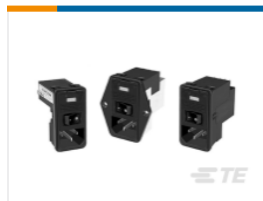
TE Part #1-6609929-4 CORCOM P SERIES MULTI- FUNCTION INLET FIL