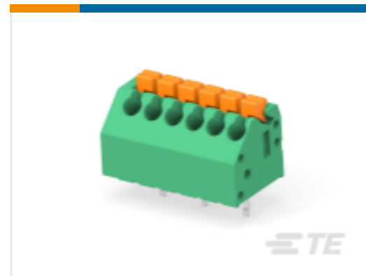
TE Part #1-2834011-6 6POS 3.5MM TOP ENTRY SCREWLESS CONN.