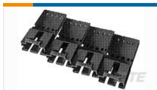
TE Part #103653-2 03 MTE SHRD PIN HSG SR LATCH