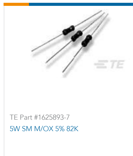
TE Part #1625893-7 5W SM M/OX 5% 82K