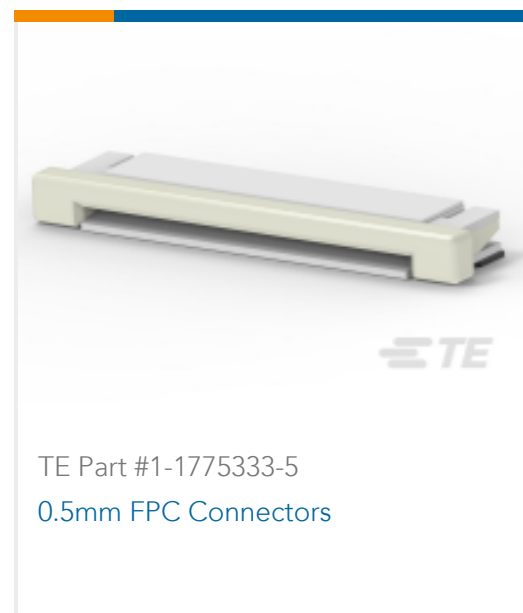
TE Part #1-1775333-5 0.5mm FPC Connectors