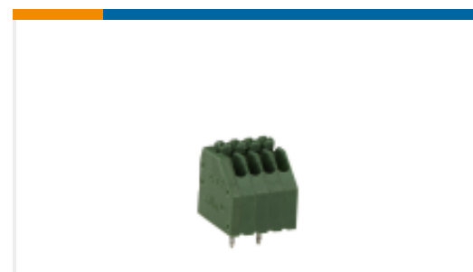
TE Part #1-2834021-3 3POS 2.5MM TES CONN.