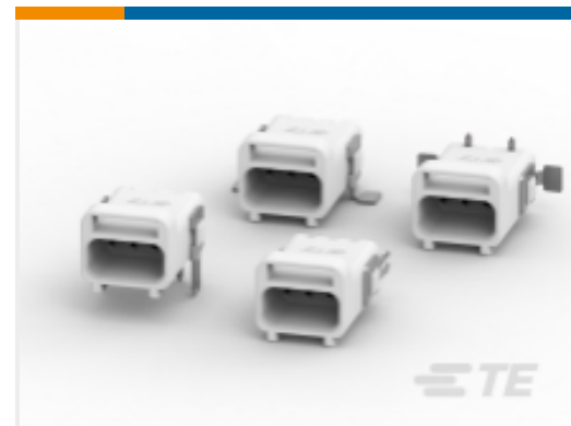
TE Part # CAT-SL36-M6642B SLIMSEAL MINIATURE HEADERS