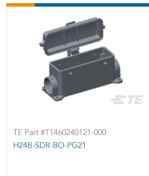
TE Part #T1460240121-000 H24B-SDR-BO-PG21