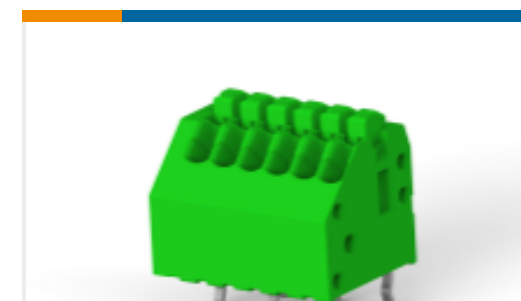
TE Part #1-2834021-6 6POS 2.5MM TES CONN.