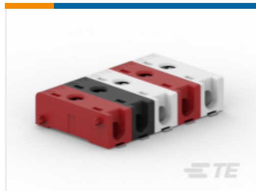
TE Part # CAT-B8519-P7565 BUCHANAN WIREMATE POKE-IN