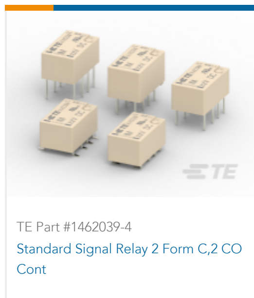
TE Part #1462039-4 Standard Signal Relay 2 Form C, 2 CO Cont