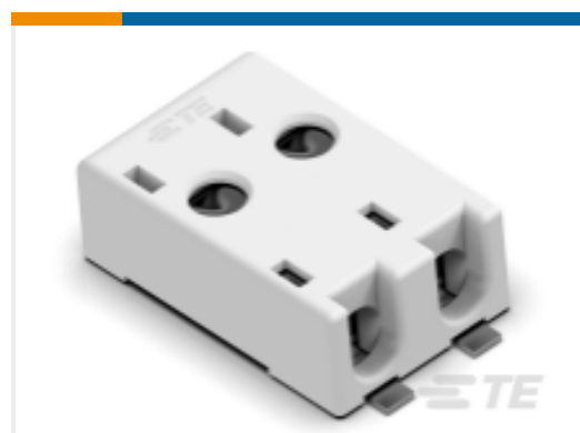
TE Part # 2834385-2 RELEASE POKE-IN CONNECTOR_2P_NATURAL