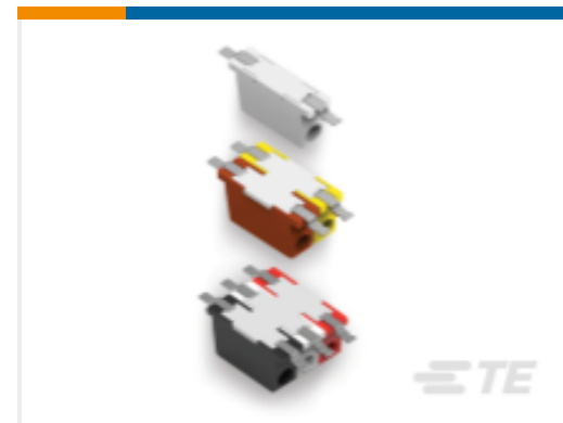
TE Part # CAT-B2125-P7565 Buchanan WireMate ITB Poke-In