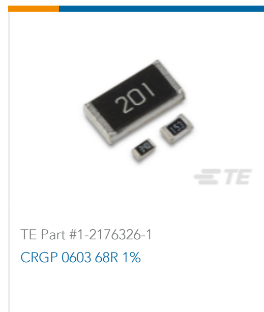
TE Part #1-2176326-1 CRGP 0603 68R 1%