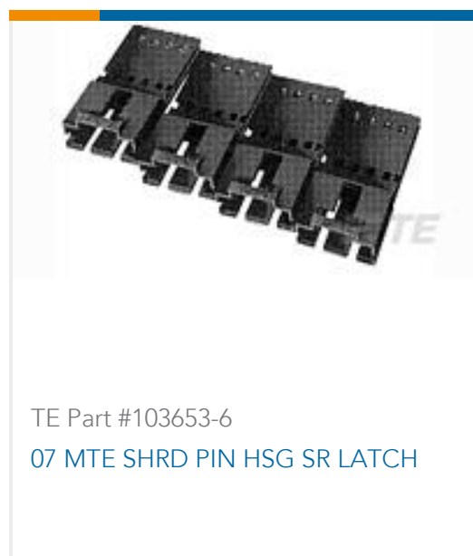
TE Part #103653-6 07 MTE SHRD PIN HSG SR LATCH