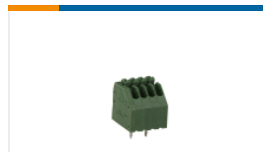
TE Part #1-2834021-4 4POS 2.5MM TES CONN.