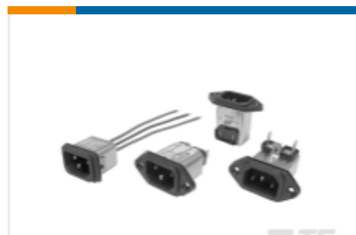
TE Part #5-1609987-8 CORCOM SRB SERIES IEC FILTERED INLETS