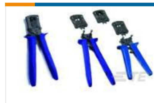
TE Part #1-1579004-2 CSV10 CRIMPING HANDTOOL SOLARLOK 4-6