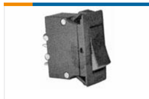
TE Part #1-1423673-8 W51-A151A1-15=CKTBKR, THERM, ROC