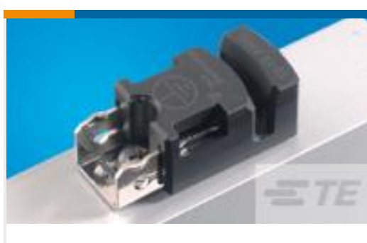
TE Part #1954381-2 Asy, Grounding Clip, 10-12 AWG w