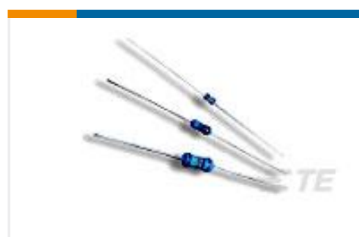
TE Part #1622293-1 LR0204 1% 91R