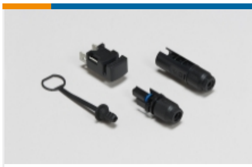
Solar Connectors &amp; Adapters(12)