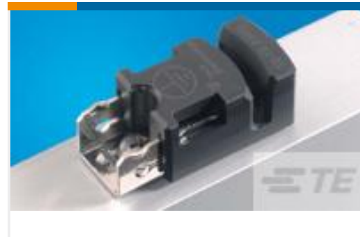
TE Part #1954381-1 Asy, Grounding Clip, 10-12 AWG S