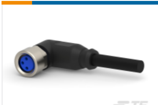
TE Part #2273012-4 M8 R/A LED PIGTAIL