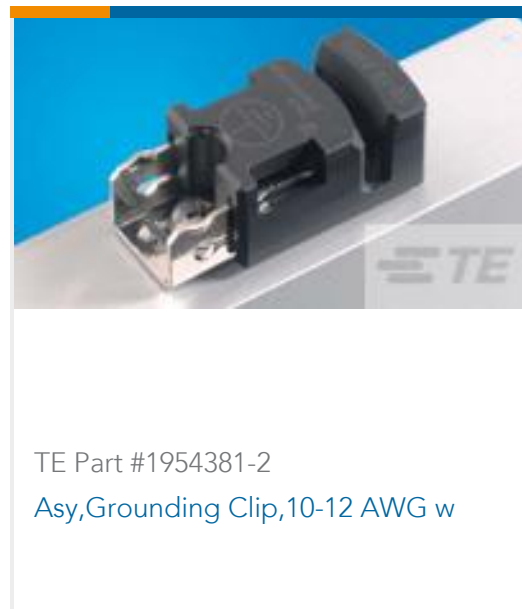
TE Part #1954381-2 Asy,Grounding Clip,10-12 AWG w