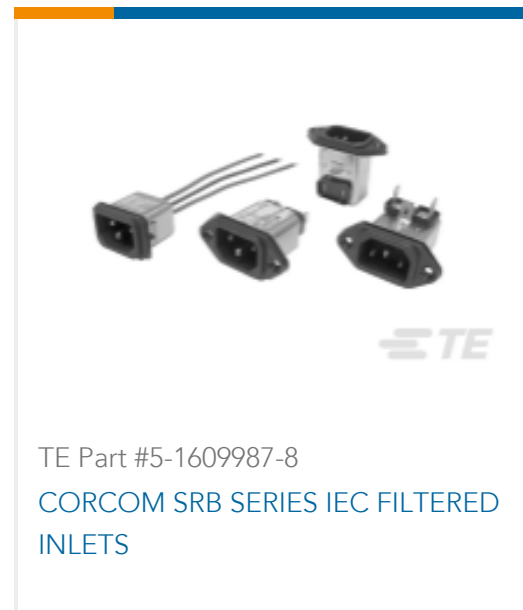
TE Part #5-1609987-8 CORCOM SRB SERIES IEC FILTERED INLETS