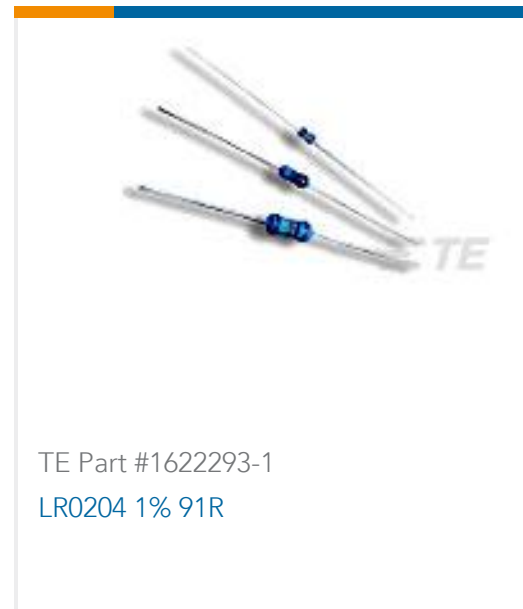
TE Part #1622293-1 LR0204 1% 91R