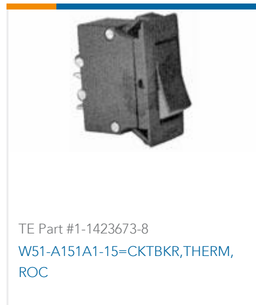
TE Part #1-1423673-8 W51-A151A1-15=CKTBKR,THERM, ROC