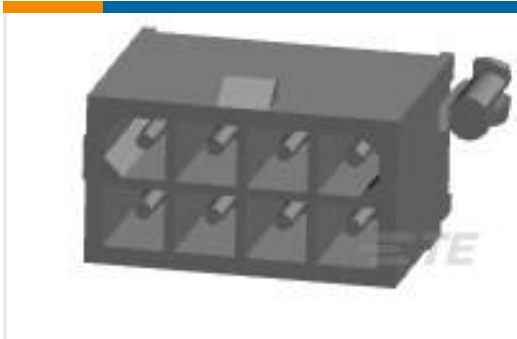
TE Part #1-794073-0 08P MINI UMNHL HDR W/O DH SN LF