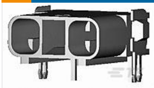
TE Part # 2106111-3 Assembly, Right Angle TH Header, 2-Posit