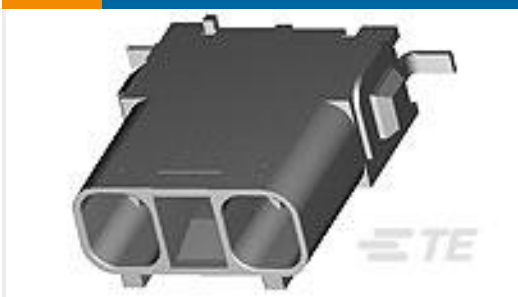
TE Part # 2106053-3 Assembly, Vertical SMT Header, 2-Positio