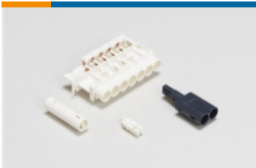
Plug & Socket Lighting Connectors(25)