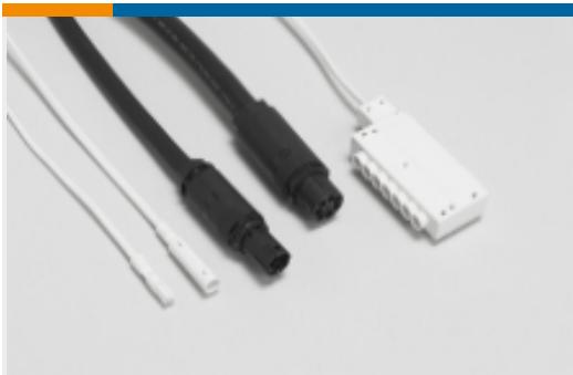
Lighting Cable Assemblies(1)