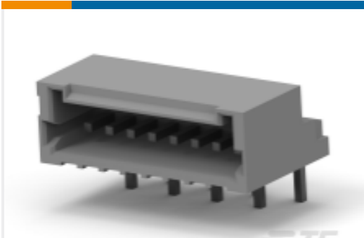
TE Part #1-292230-4 MINI COMMON TERMINATION HEADERS