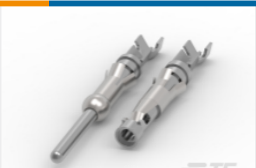
TE Part #1-66360-2 TYPE III CONTACTS LP