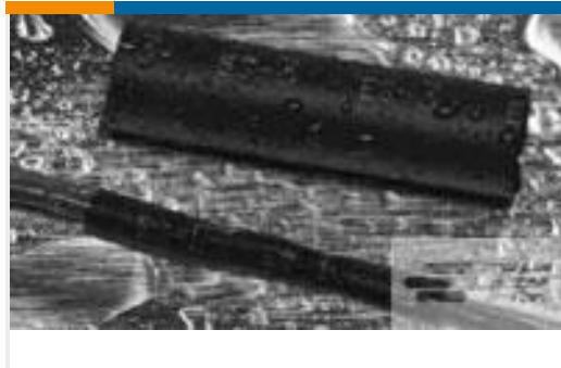
TE Part #121397P024 ES2000-NO.3-B8-0-STK