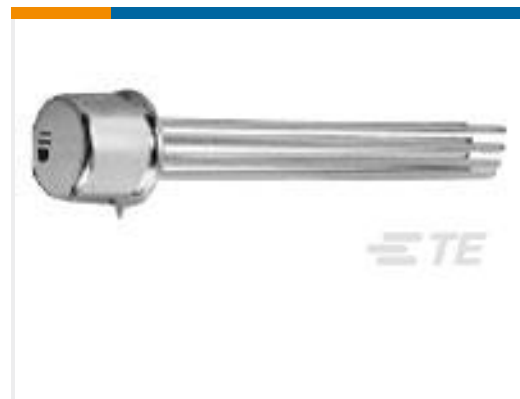
TE Part #1617119-5 J1MAW-18XP = M39016/7-021P