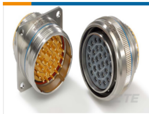
TE Part #ZPF000000000007174 983-ORS 08-98 PN