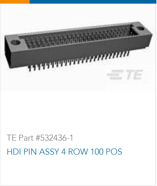
TE Part #532436-1 HDI PIN ASSY 4 ROW 100 POS