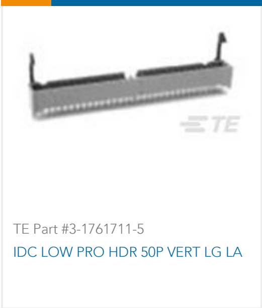
TE Part #3-1761711-5 IDC LOW PRO HDR 50P VERT LG LA