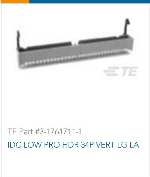
TE Part #3-1761711-1 IDC LOW PRO HDR 34P VERT LG LA