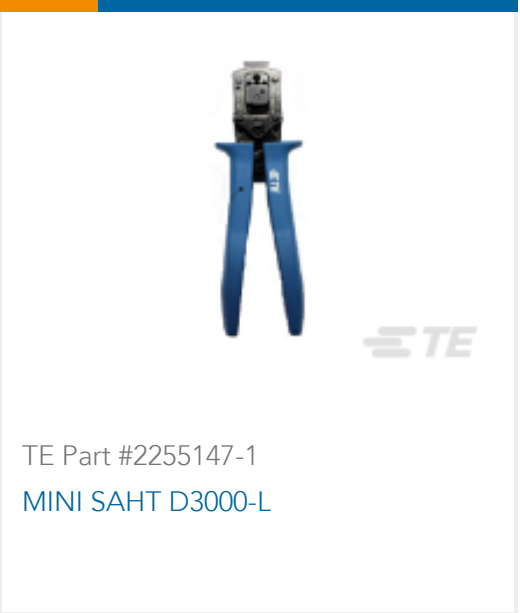
TE Part #2255147-1 MINI SAHT D3000-L