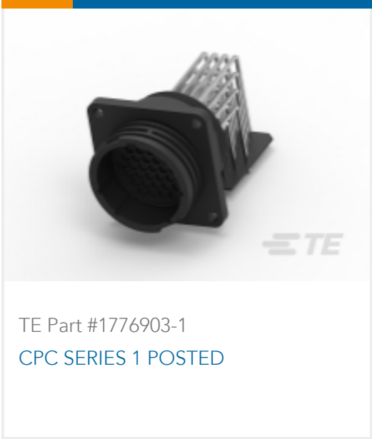
TE Part #1776903-1 CPC SERIES 1 POSTED