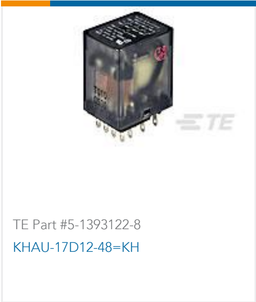
TE Part #5-1393122-8 KHAU-17D12-48=KH