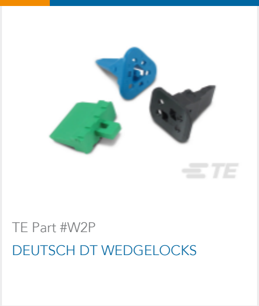
TE Part #W2P DEUTSCH DT WEDGELOCKS