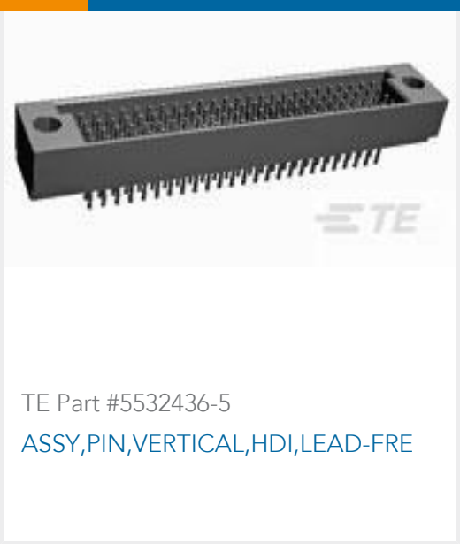
TE Part #5532436-5 ASSY,PIN,VERTICAL,HDI,LEAD-FRE