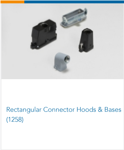
Rectangular Connector Hoods & Bases (1258)