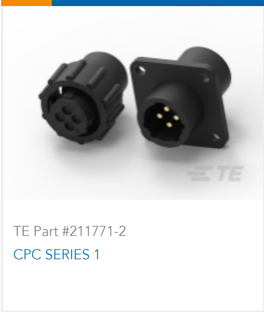
TE Part #211771-2 CPC SERIES 1