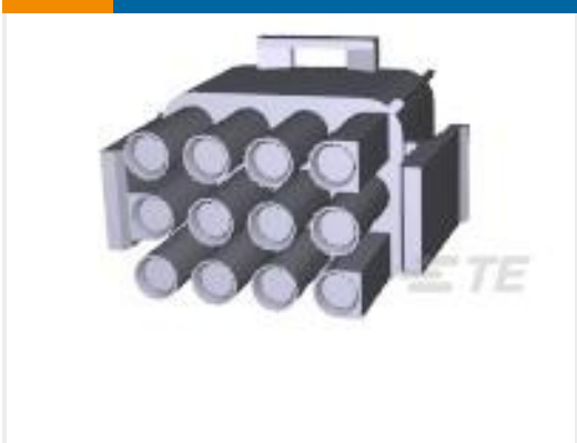
TE Part #1-480708-9 12P UMN PLUG HSG BLK