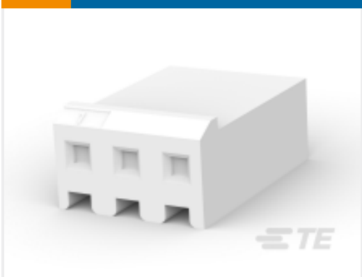
TE Part #640250-1 3.96mm Wire-to-board housing: receptacle, with mating alignment, SL 156