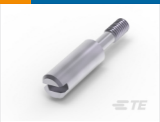
TE Part #T0931003003-000 CODING-PIN-M3