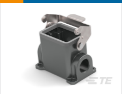
TE Part #T1610062120-000 H6B-SGRS-M20