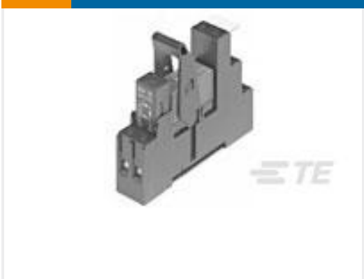
TE Part #5-1415073-1 RT3S4R24