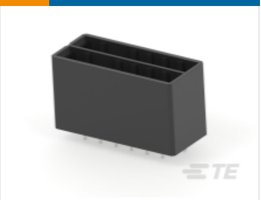
TE Part #1-917657-5 DYNAMIC 3200 HDR ASSY