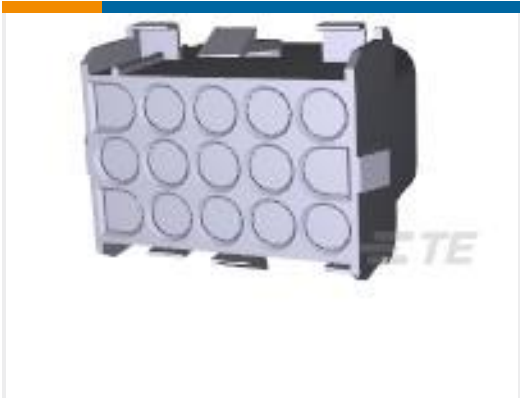
TE Part #1-480711-9 15P UMN CAP HSG BLK