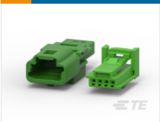
TE Part #1473203-1 TH/.025 CONNECTOR SYSTEM, HOUSING