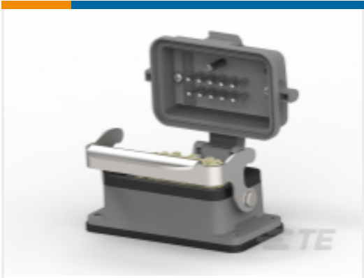
TE Part #T2120100219-000 ZGG-10DSTK,1-7,2-8,3-9,4-6,5-10

Product Drawings H16BPR-TG/SHC-M40/M25-EMC-C