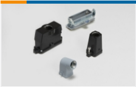
Rectangular Connector Hoods & Bases (445)