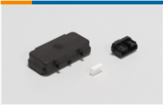
Rectangular Caps & Covers(4)