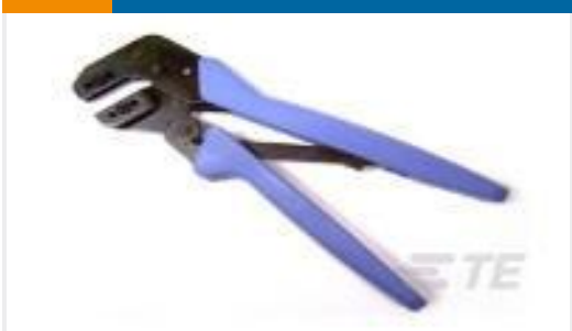
TE Part #58433-3 PRO CR ASSY, RBY IS9252