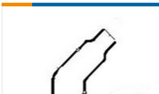
TE Part #642427-000 Heat Shrink Boots: Poly Mold, Lipped