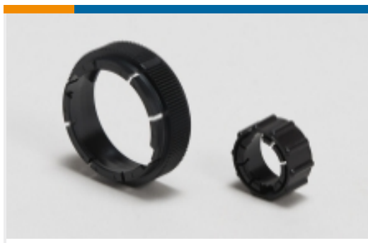
Circular Connector Adapters(16)