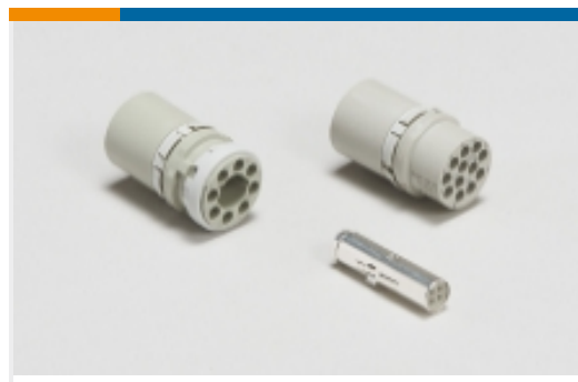
Circular Connector Contact Inserts(16)