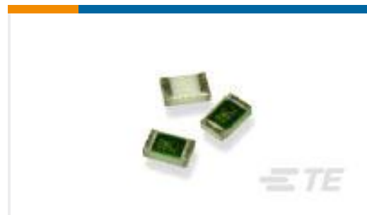
TE Part #2-1614894-3 CPF 0805 301K 0.1% 25PPM 1K RL