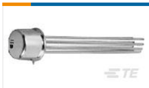
TE Part #1617119-5 J1MAW-18XP = M39016/7-021P