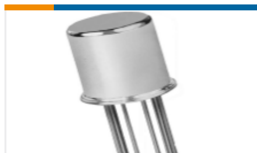
TE Part #1617164-7 JMACT-5XL = M28776/1-025L