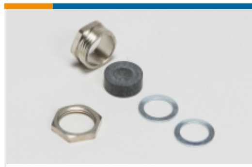
Circular Connector Hardware(8)