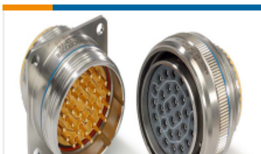
TE Part #ZPF000000000007174 983-ORS 08-98 PN