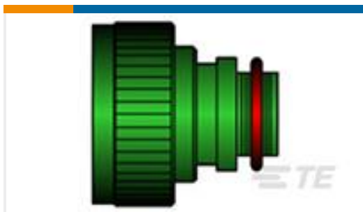
TE Part #661269-000 TXR21AB00-1605AI