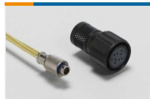
Standard Circular Connectors(71)