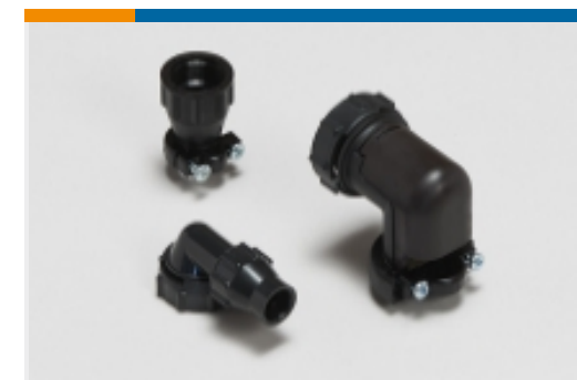
Unscreened Circular Connector Backshells & Clamps(55)