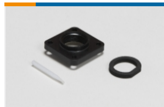
Circular Connector Seals(17)