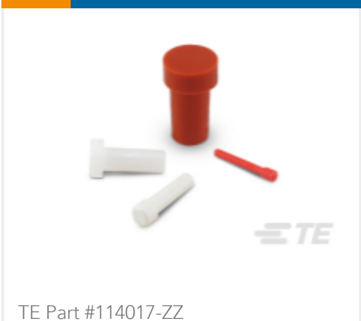
TE Part #114017-ZZ DEUTSCH SEALING PLUGS