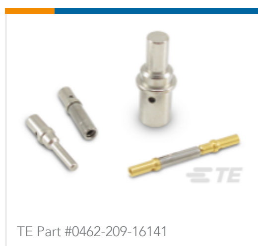
DEUTSCH SOLID CONTACTS