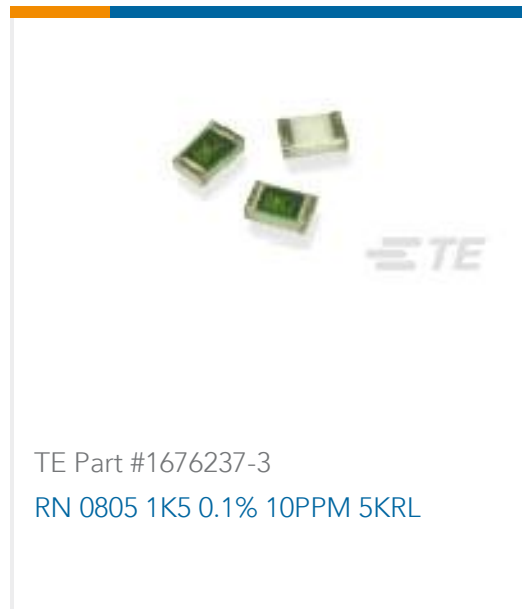
TE Part #1676237-3 RN 0805 1K5 0.1% 10PPM 5KRL