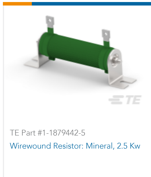
TE Part #1-1879442-5 Wirewound Resistor: Mineral, 2.5 Kw