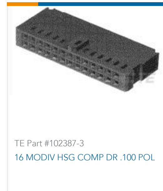
TE Part #102387-3 16 MODIV HSG COMP DR .100 POL