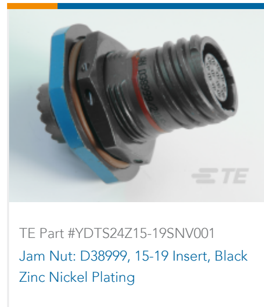
TE Part #YDTS24Z15-19SNV001 Jam Nut: D38999, 15-19 Insert, Black Zinc Nickel Plating