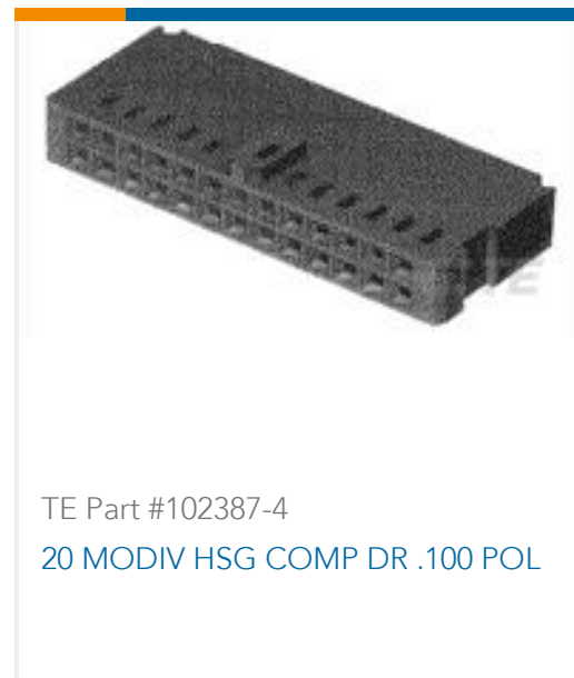
TE Part #102387-4 20 MODIV HSG COMP DR .100 POL