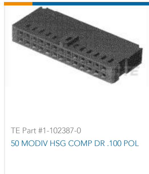
TE Part #1-102387-0 50 MODIV HSG COMP DR .100 POL