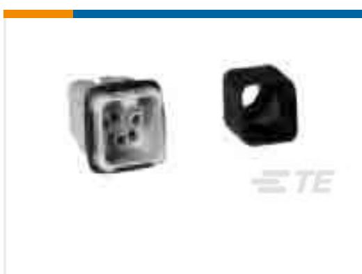
TE Part #2-1103104-3 HN.D.8.STI.C