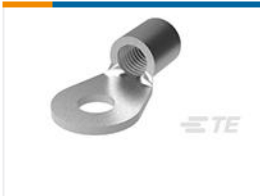
TE Part #324061 TERMINAL,SOLIS R 8 8