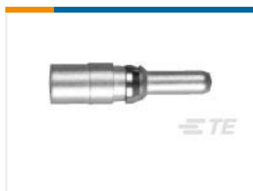
TE Part #5-1105150-1 HSS-C-Sti.Ag.16,0 qmm