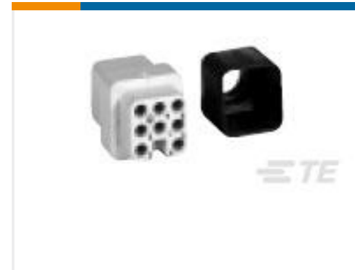
TE Part #2-1103105-3 HN.D.8.BU.C