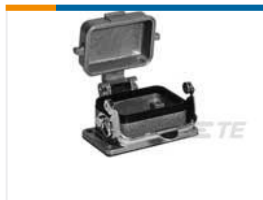
TE Part #2-1102246-2 HB-K.6.AGD-LB