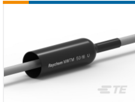
TE Part #544794-000 Medium-Wall Heat Shrink Tubing