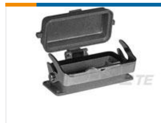
TE Part #2-1102305-2 HB-K.16.AGD-LB