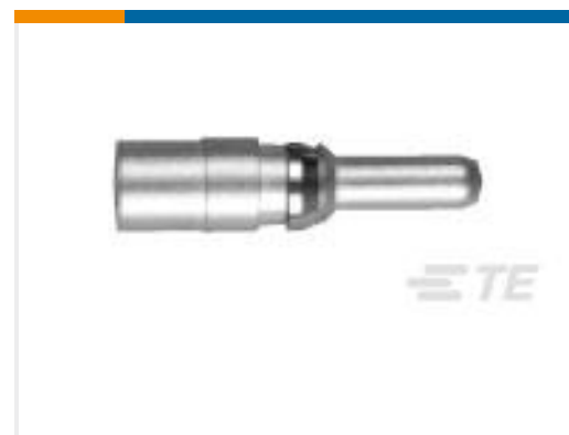
TE Part #4-1105150-1 HSS-C-Sti.Ag.10,0 qmm