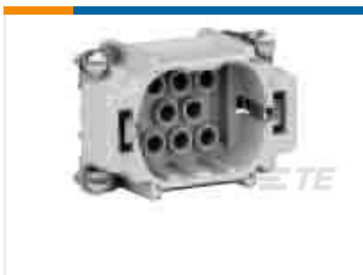
TE Part #2-1104000-3 HVT.8.STI.C