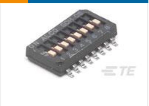
TE Part #1571983-5 GDH04STR04=DIP SWITCH