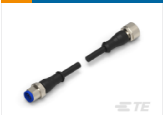
TE Part #1-2273114-4 M12 MS-FS DOUBLE END CABLE ASSY BL