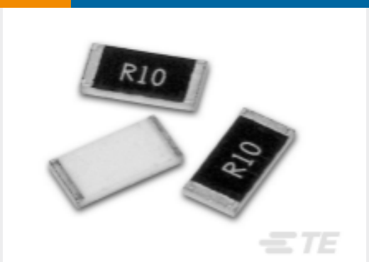
TE Part #1-2176050-0 Thick Film Resistor: Current Sense