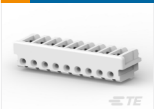
TE Part #179228-2 AMP COMMON TERMINATION HOUSINGS