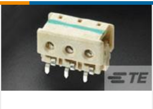
TE Part #1-2106751-4 Connector, Thru Hole-IDC, 4 pos, 20AWG