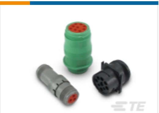
TE Part #HD16-9-96S DEUTSCH HD10 HOUSINGS