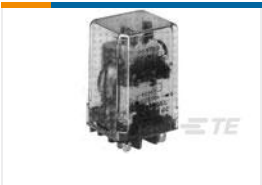
TE Part #1393116-5 KUL-5D15D-12=KU