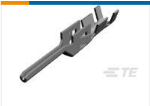
TE Part #1-794612-0 PIN CONT 20-24 TIN PLATE L/P