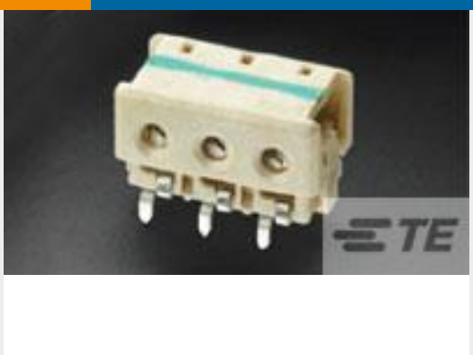
TE Part #1-2106751-3 Connector, Thru Hole-IDC, 3 pos, 20AWG