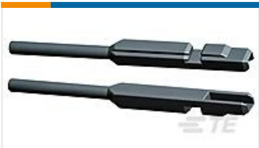
TE Part #1394872-1 SEALING PLUG 1,5MM