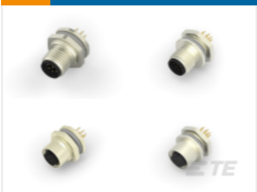
TE Part #T4140412021-000 M12 Panel Mount PCB