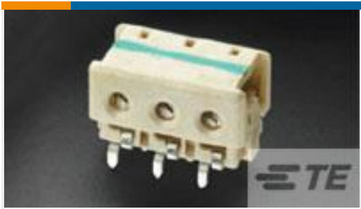
TE Part # 2-2106489-3 Connector, Thru Hole-IDC, 3 pos, 22AWG