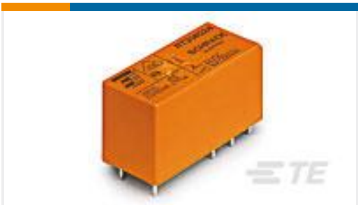
TE Part #1-1649329-5 RT424024