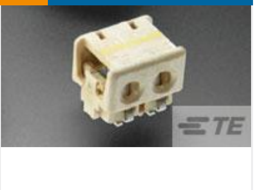
TE Part #2-2106431-3 Connector, SMT-IDC PASS THRU, 3 POS, 22