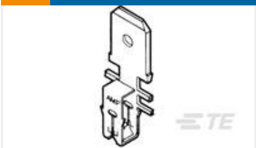
TE Part #2232555-1 MAG-MATE W/250 CONN TAB TPBR