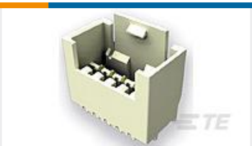
TE Part #1-1971921-3 2/3P,RAST 2.5 Tab Header,Ex- Locking, THV