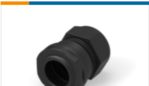
TE Part #1478769-3 ANTI-VIB NYLON GLD 20MM BLK