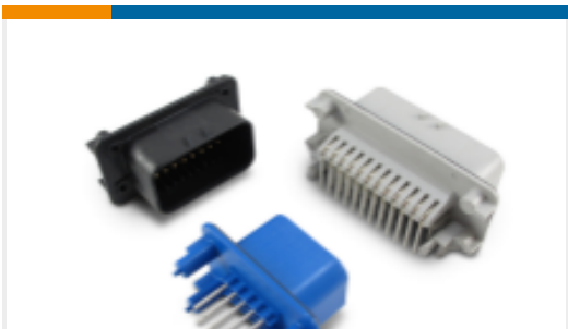
TE Part #1-776087-2 AMPSEAL HEADERS