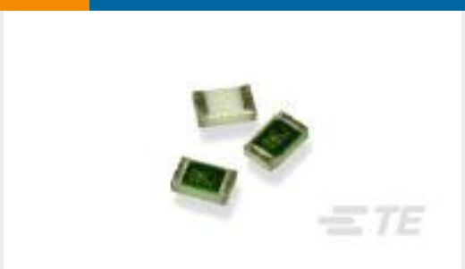
TE Part #1614885-2 CPF0805 100R 0.1% 25PPM 5K RL