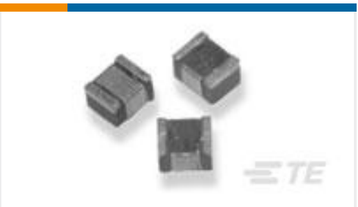
TE Part #1-2176086-1 3654 0402 5.1nH 5% 2K RL