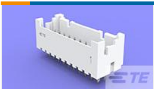
TE Part #1-1969582-0 ASSY, HDR, VERT, NO-BOSS, DUAL ROW,EP2.5