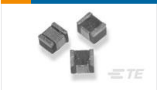
TE Part #1-1624112-7 3650 0402 2.7nH 5% 2K RL