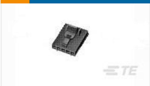
TE Part #104257-1 02 MTE RCPT HSG SR LATCH .100