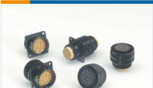
TE Part #ZPF00000000019494 FDPA 56-20-16 PN-K 059