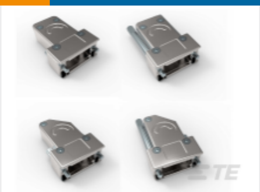
TE Part #1-2308340-8 D-SUB BACKSHELL SIZE 1