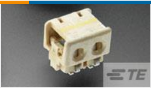
TE Part # 3-2106431-1 Connector, SMT-IDC PASS THRU, 1 POS, 24