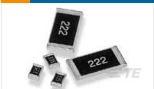
TE Part #1623168-1 CRG0805 1% 270K