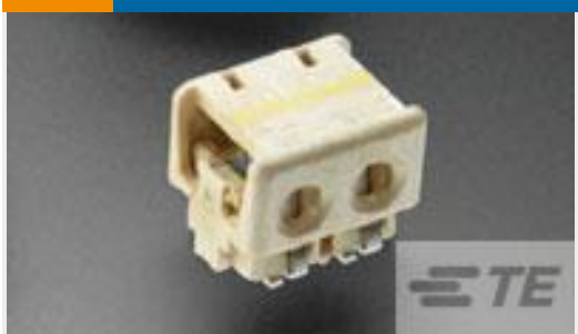
TE Part #1-2106003-2 Connector, SMT-IDC, 2 POS, 20 AWG