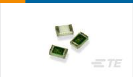
TE Part #1879208-7 CPF 0402 18R 0.1% 25PPM 1K RL