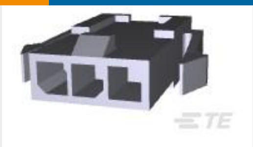
TE Part #1445048-3 PANEL MT SINGL ROW HSG 3 POS