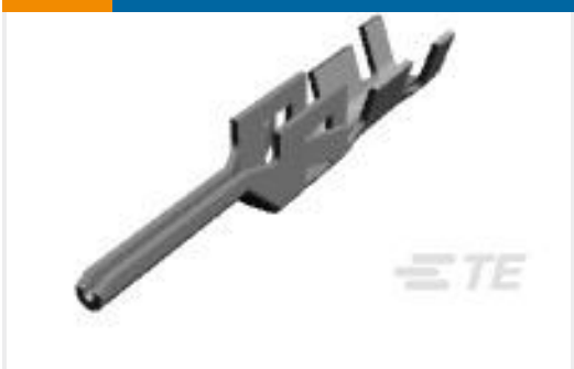
TE Part #1-794612-0 PIN CONT 20-24 TIN PLATE L/P