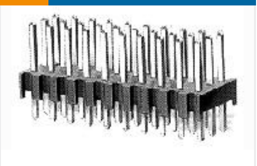
TE Part #103817-6 24 MODII HDR 3RST UNSHRD .100