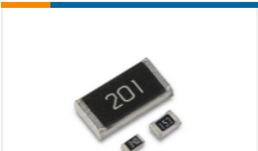
TE Part #2-2176326-6 CRGP 0603 1K2 1%