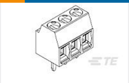
TE Part #1776112-2 2P, 3.50MM, SIDE ENTRY, HIGH TMP