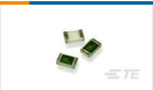
TE Part #1879338-3 CPF 0603 28K 1% 50PPM 1K RL