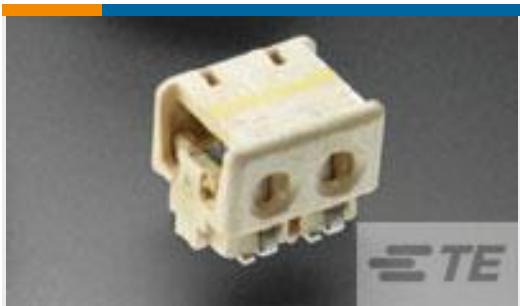
TE Part #2-2106003-4 Connector, SMT-IDC, 4 POS, 22 AWG