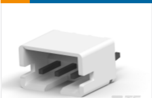
TE Part #1775469-2 AMP HPI 2.0MM HEADERS