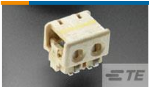
TE Part #2-2106003-2 Connector, SMT-IDC, 2 position, 22AWG