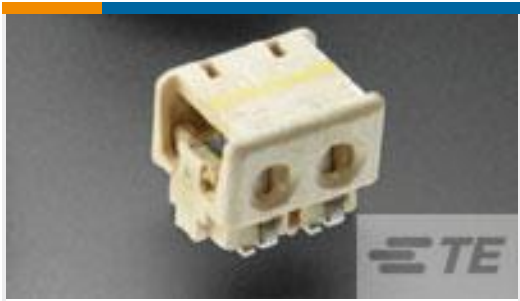
TE Part # 3-2106431-2 Connector, SMT-IDC PASS THRU, 2 POS, 24