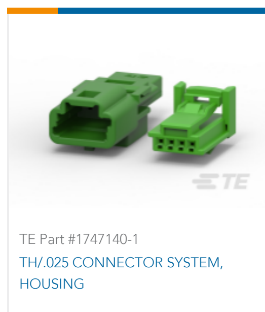
TE Part #1747140-1 TH/.025 CONNECTOR SYSTEM, HOUSING