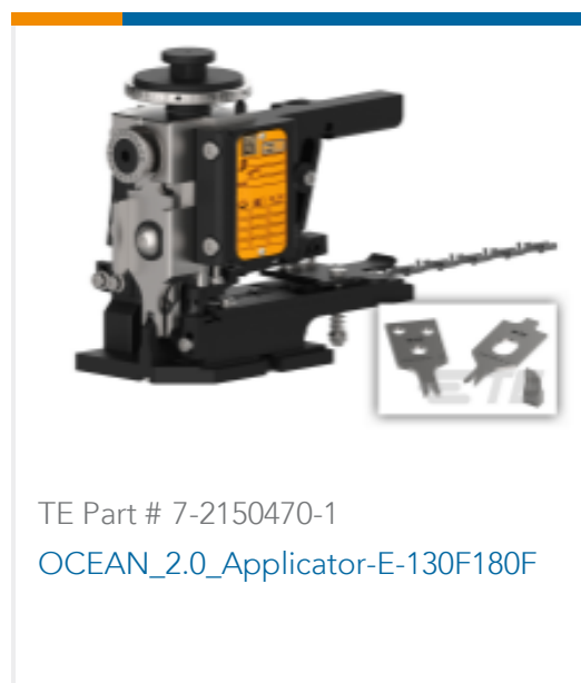
TE Part # 7-2150470-1 OCEAN_2.0_Applicator-E-130F180F