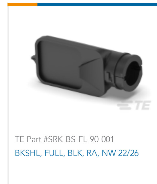
TE Part #SRK-BS-FL-90-001 BKSHL, FULL, BLK, RA, NW 22/26