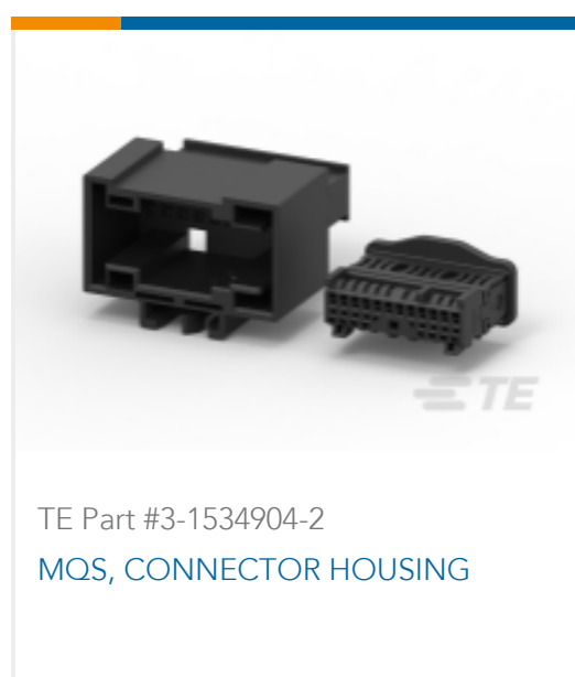
TE Part #3-1534904-2 MQS, CONNECTOR HOUSING