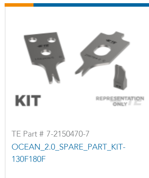
TE Part # 7-2150470-7 OCEAN_2.0_SPARE_PART_KIT-130F180F