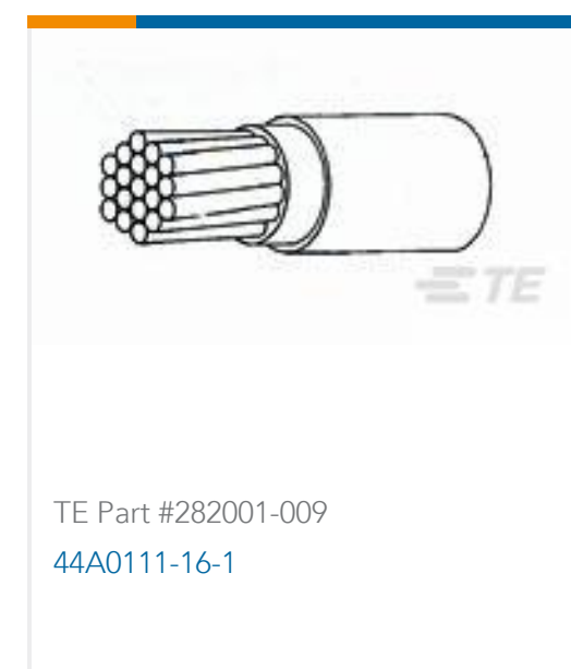
TE Part #282001-009 44A0111-16-1