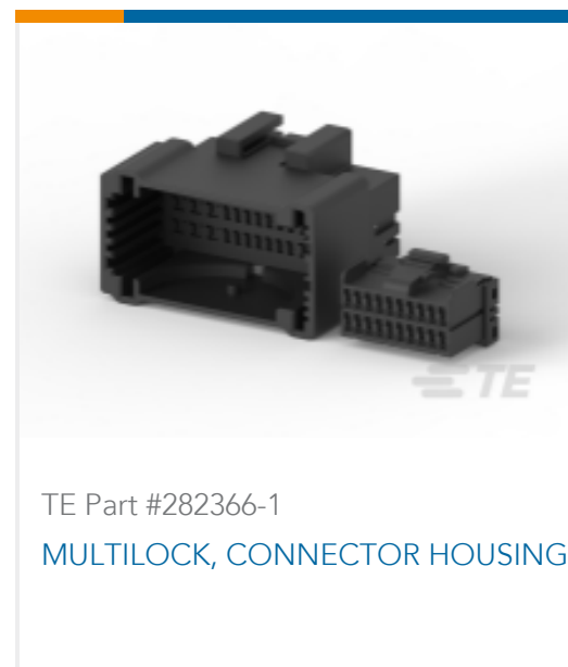
TE Part #282366-1 MULTILOCK, CONNECTOR HOUSING