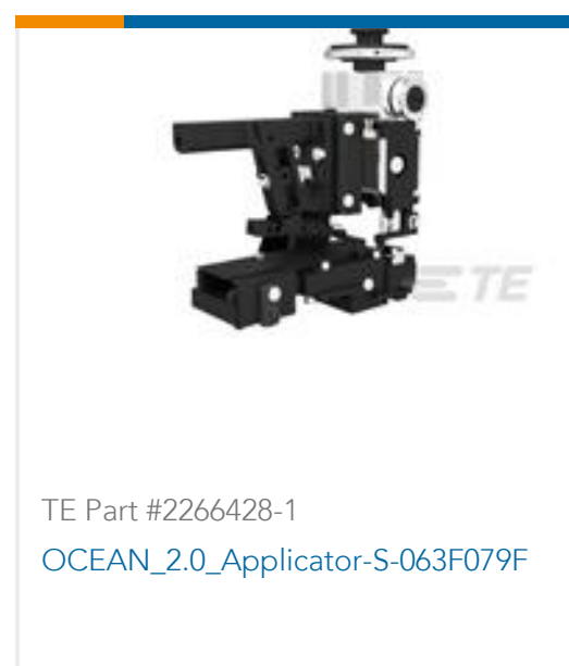
TE Part #2266428-1 OCEAN_2.0_Applicator-S-063F079F