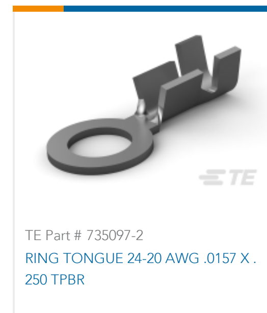
TE Part # 735097-2 RING TONGUE 24-20 AWG .0157 X .250 TPBR