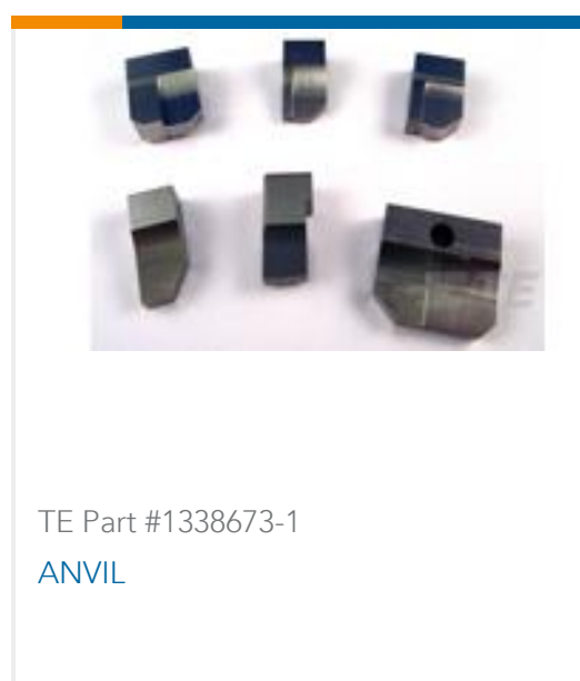
TE Part #1338673-1 ANVIL