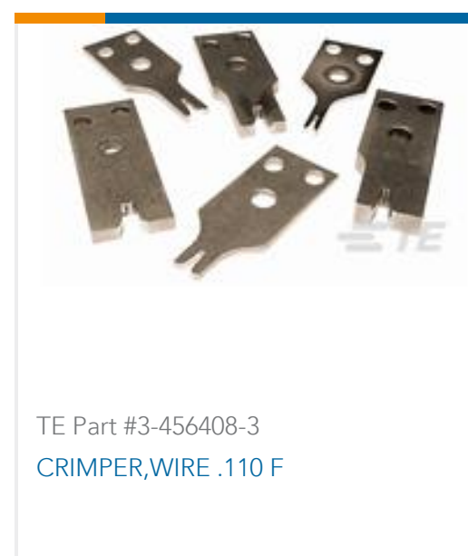
TE Part #3-456408-3 CRIMPER,WIRE .110 F