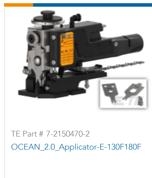
TE Part # 7-2150470-2 OCEAN_2.0_Applicator-E-130F180F