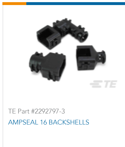
TE Part #2292797-3 AMPSEAL 16 BACKSHELLS