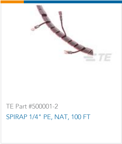
TE Part #500001-2 SPIRAP 1/4" PE, NAT, 100 FT