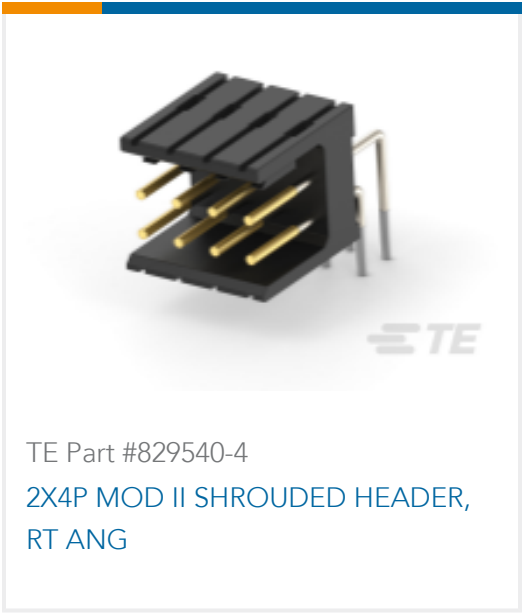
TE Part #829540-4 2X4P MOD II SHROUDED HEADER, RT ANG