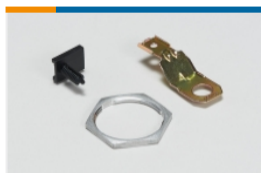
Other Automotive Connector Accessories(13)