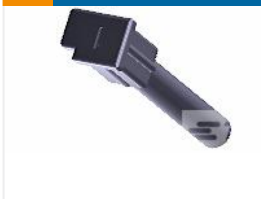
TE Part #1-1452424-2 BLIND PLUG FOR MCON 1.2 CB (1.)