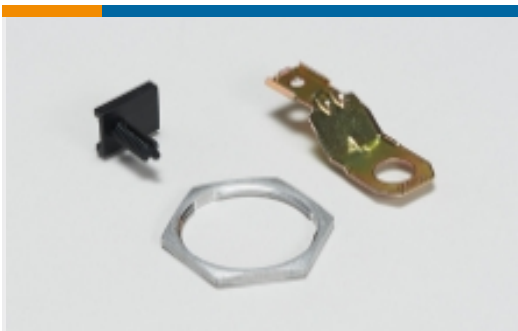
Other Automotive Connector Accessories(13)