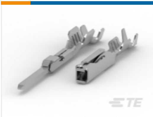
TE Part #1393364-2 GET .64 CONNECTOR SYSTEM, RECEPT AND TAB