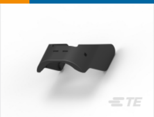
TE Part #1-1355133-1 HEBEL F.AUFNAHM-GEH