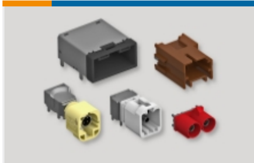
Data Connectivity Headers(1)