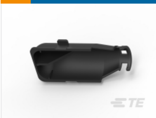
TE Part #1-1355122-2 SHIELD, 60POSN. RECEPTACLE HOU