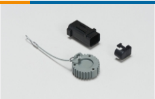
Automotive Connector Caps & Covers (133)