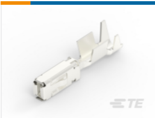
TE Part #967542-2 AMP MCP, SFC, RECEPTACLE