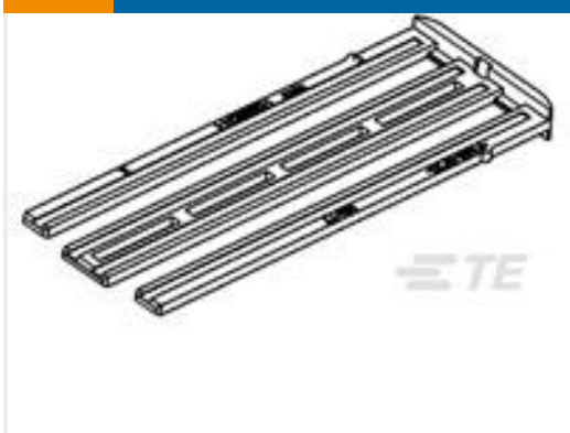
TE Part #1-1355134-1 RETAINER 94P