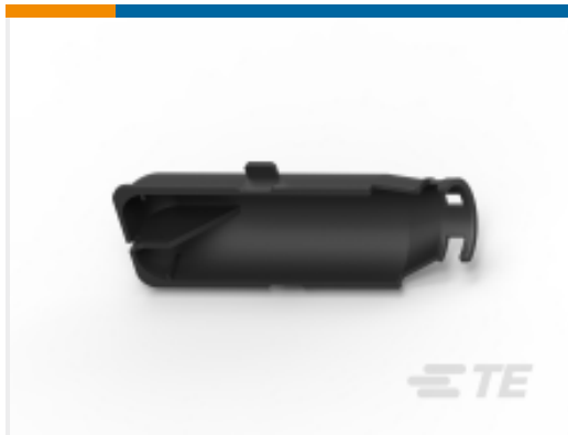
TE Part #1-1355132-2 SHIELD, 94POSN., RECEPTACLE HO