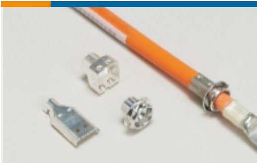
Automotive Connector EMC Shielding (2)