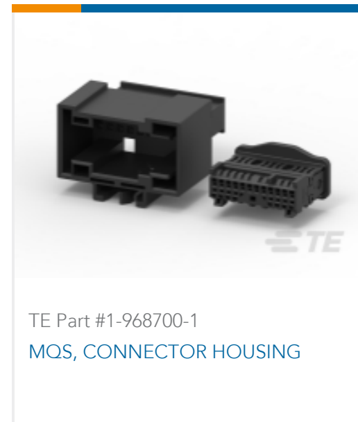
TE Part #1-968700-1 MQS, CONNECTOR HOUSING