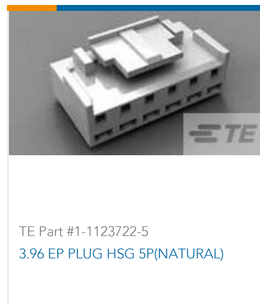
TE Part #1-1123722-5 3.96 EP PLUG HSG 5P(NATURAL)