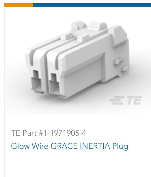
TE Part #1-1971905-4 Glow Wire GRACE INERTIA Plug