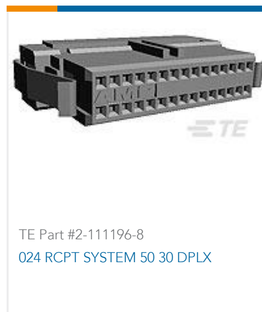
TE Part #2-111196-8 024 RCPT SYSTEM 50 30 DPLX