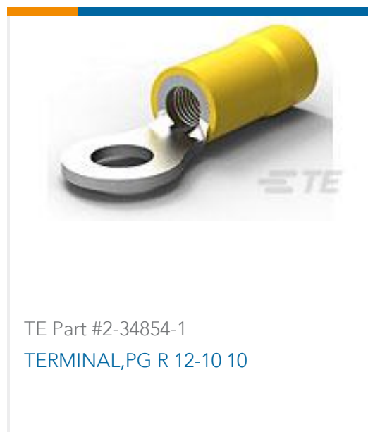
TE Part #2-34854-1 TERMINAL,PG R 12-10 10