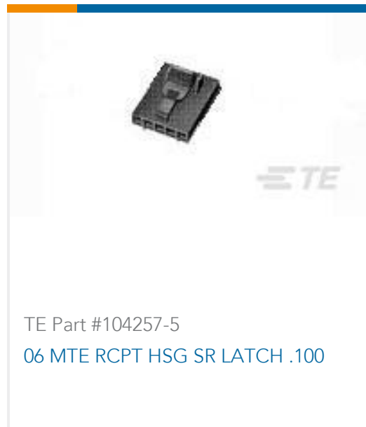
TE Part #104257-5 06 MTE RCPT HSG SR LATCH .100