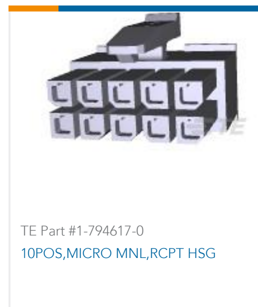
TE Part #1-794617-0 10POS,MICRO MNL,RCPT HSG