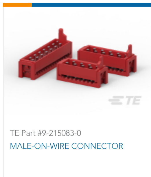
TE Part #9-215083-0 MALE-ON-WIRE CONNECTOR