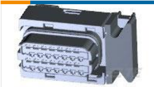
TE Part #1393436-4 V23542C1028B300=KABELBAUMST. 8