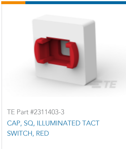
TE Part #2311403-3 CAP, SQ, ILLUMINATED TACT SWITCH, RED