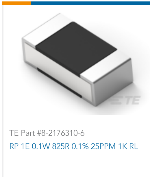
TE Part #8-2176310-6 RP 1E 0.1W 825R 0.1% 25PPM 1K RL