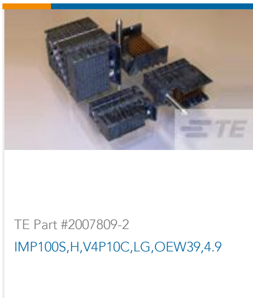
TE Part #2007809-2 IMP100S,H,V4P10C,LG,OEWS39,4.9

CAP, SQ, ILLUMINATED TACT SWITCH, YELLOW