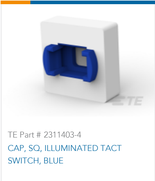
TE Part # 2311403-4 CAP, SQ, ILLUMINATED TACT SWITCH, BLUE