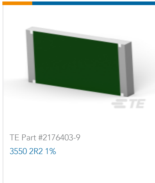
TE Part #2176403-9 3550 2R2 1%