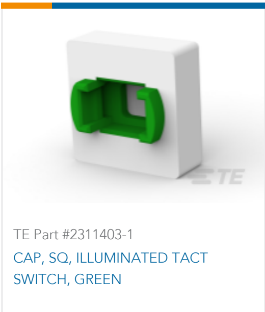
TE Part #2311403-1 CAP, SQ, ILLUMINATED TACT SWITCH, GREEN