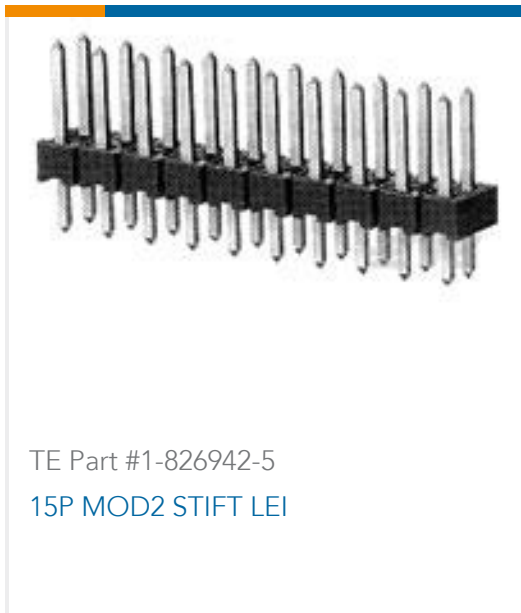
TE Part #1-826942-5 15P MOD2 STIFT LEI