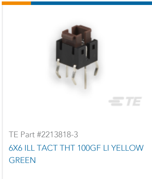
TE Part #2213818-3 6X6 ILL TACT THT 100GF LI YELLOW GREEN