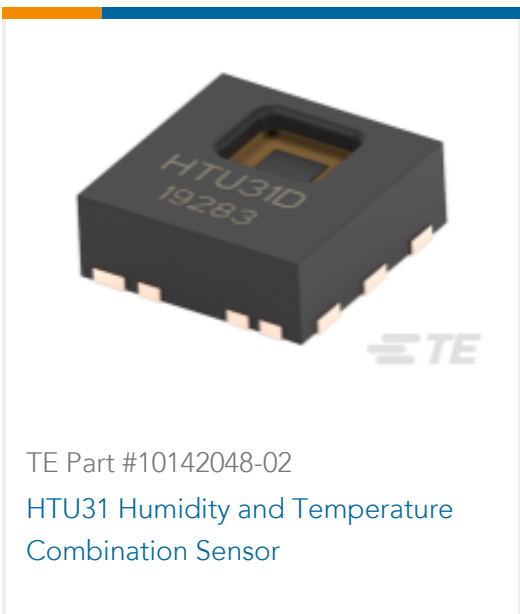
TE Part #10142048-02 HTU31 Humidity and Temperature Combination Sensor