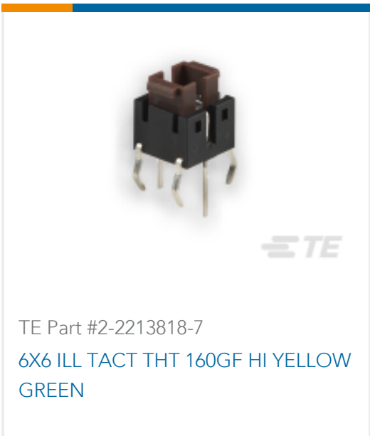
TE Part #2-2213818-7 6X6 ILL TACT THT 160GF HI YELLOW GREEN