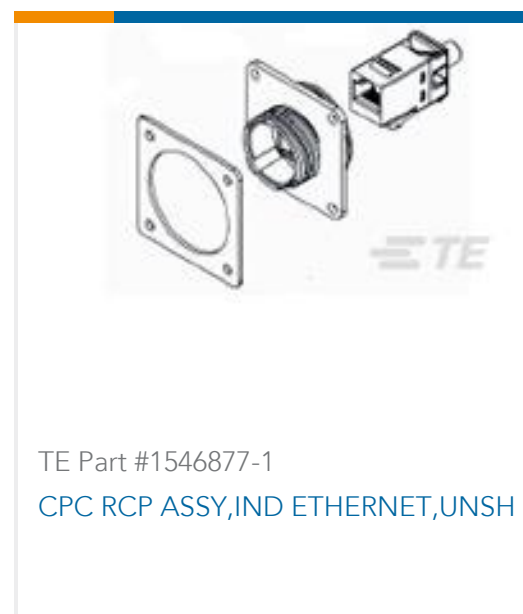
TE Part #1546877-1 CPC RCP ASSY,IND ETHERNET,UNSH