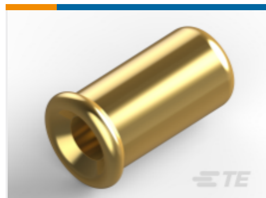
TE Part #1-332070-1 Mini Spring Sockets: Closed Bottom, 6.5A