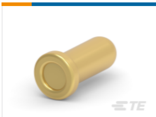
TE Part #1-5050871-0 Mini Spring Sockets: Open Bottom, 7.5A