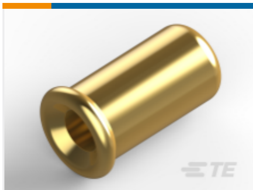
TE Part # CAT-377-MSSCB65 Mini Spring Sockets: Closed Bottom, 6.5A