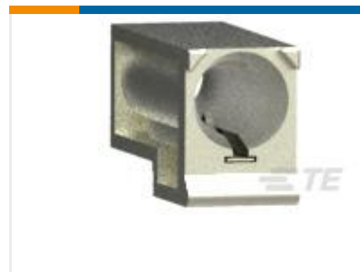
TE Part #1-1469492-1 MULTIGIG RT 9MM GUIDE/ESD 0 DEG