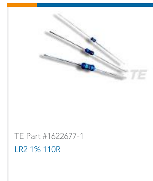
TE Part #1622677-1 LR2 1% 110R