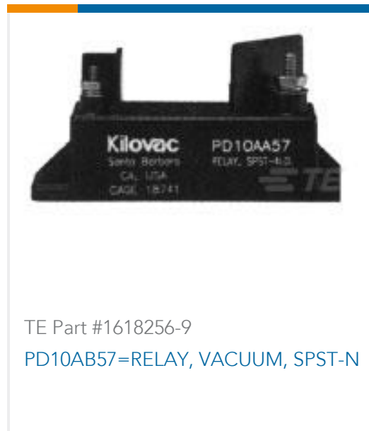
TE Part #1618256-9 PD10AB57=RELAY, VACUUM, SPST-N