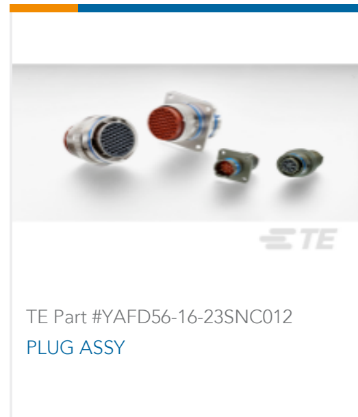
TE Part #YAFD56-16-23SNC012 PLUG ASSY