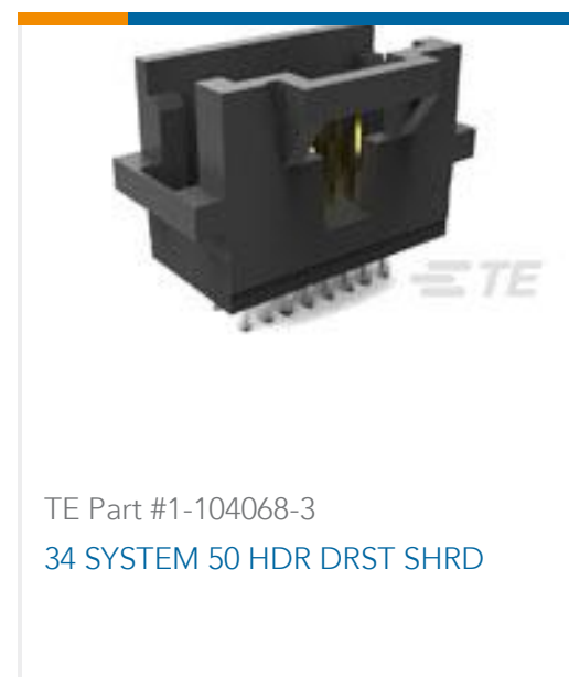
TE Part #1-104068-3 34 SYSTEM 50 HDR DRST SHRD