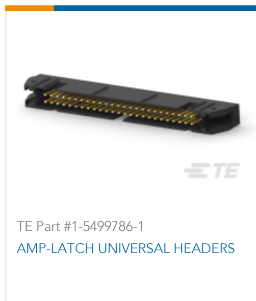
TE Part #1-5499786-1 AMP-LATCH UNIVERSAL HEADERS