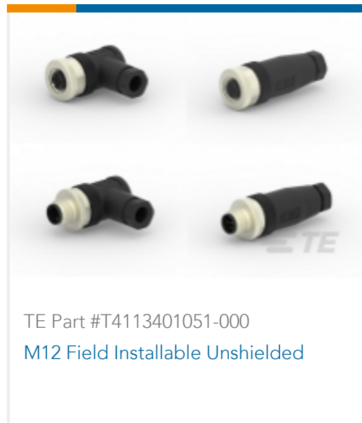
TE Part #T4113401051-000 M12 Field Installable Unshielded