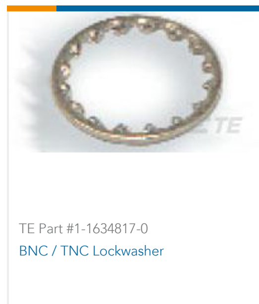
TE Part #1-1634817-0 BNC / TNC Lockwasher