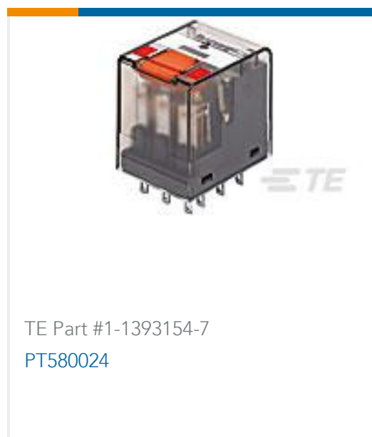
TE Part #1-1393154-7 PT580024