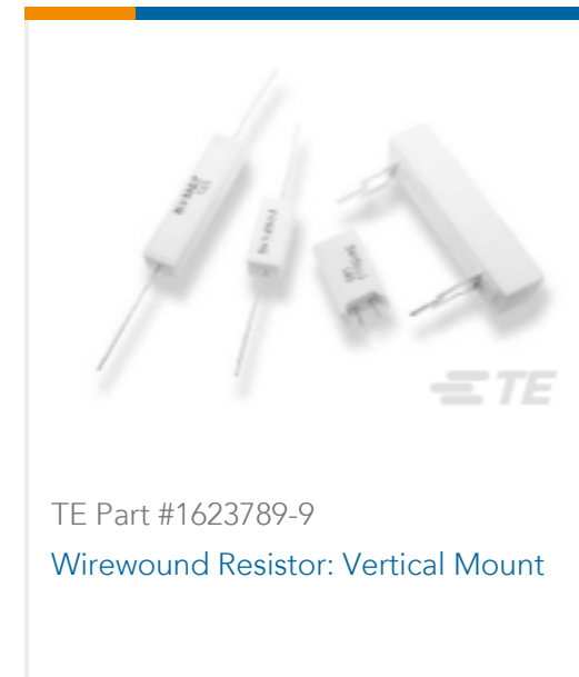
TE Part #1623789-9 Wirewound Resistor: Vertical Mount