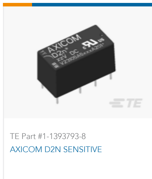
TE Part #1-1393793-8 AXICOM D2N SENSITIVE