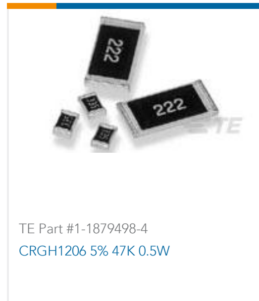
TE Part #1-1879498-4 CRGH1206 5% 47K 0.5W