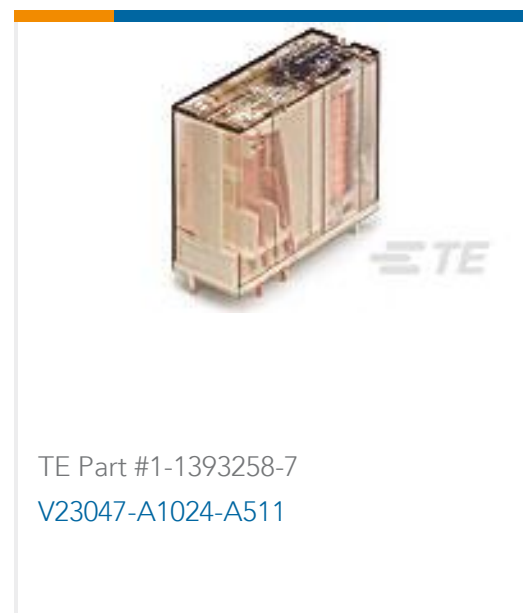
TE Part #1-1393258-7 V23047-A1024-A511