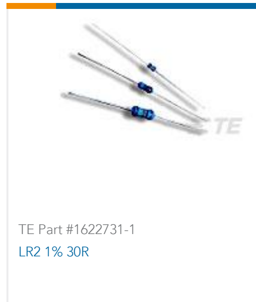
TE Part #1622731-1 LR2 1% 30R