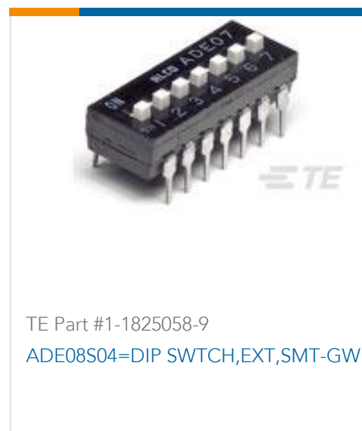
TE Part #1-1825058-9 ADE08S04=DIP SWITCH,EXT,SMT-GW