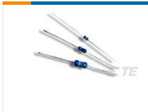
TE Part #1622780-1 LR2 1% 75K