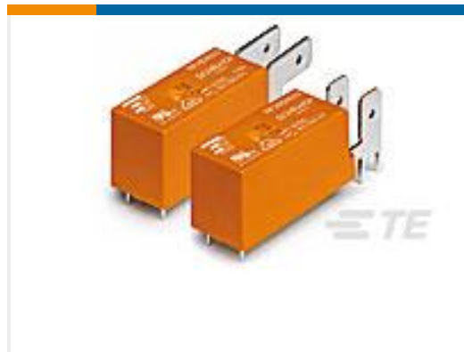
TE Part #8-1415513-1 RF334012