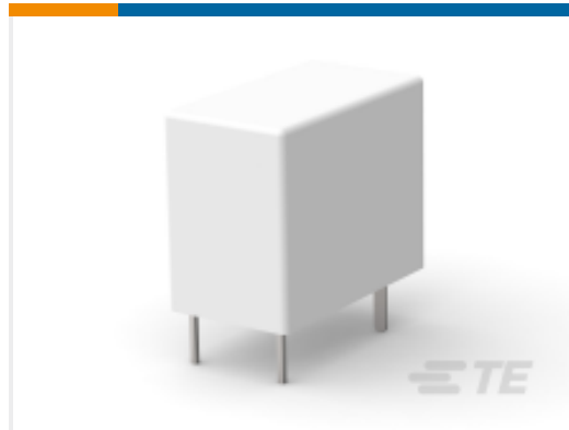
TE Part #1461406-4 STD OEG Miniature PCB OJ/OJE Pow Relays