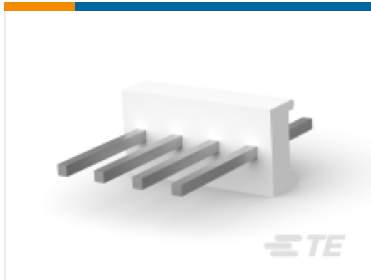
TE Part #1-640456-0 Polyester Vertical PCB Header: 2.54 mm, Unshrouded, No Mating Alignment