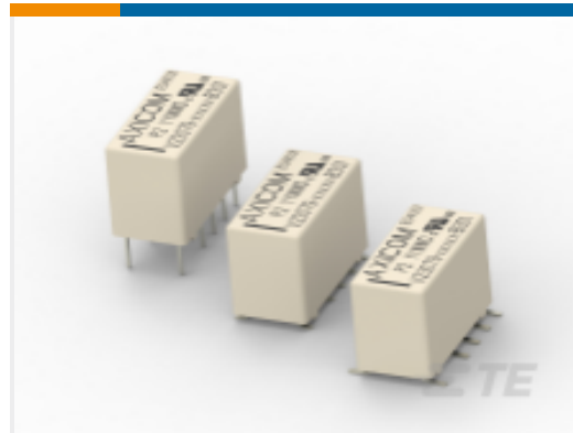
TE Part #1422002-8 AXICOM P2 STANDARD