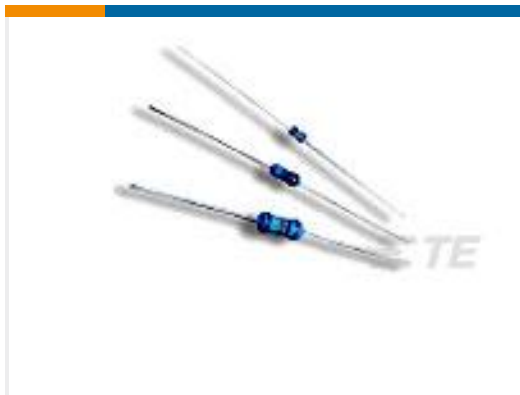
TE Part #1622694-1 LR2 1% 16K