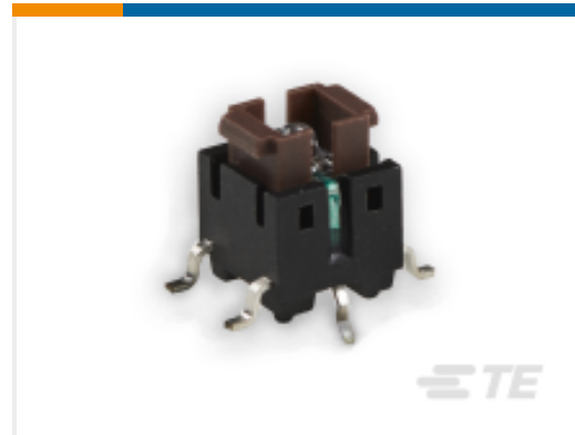
TE Part #1-2213819-0 6X6 ILL TACT SMT 100GF HI PURE GREEN