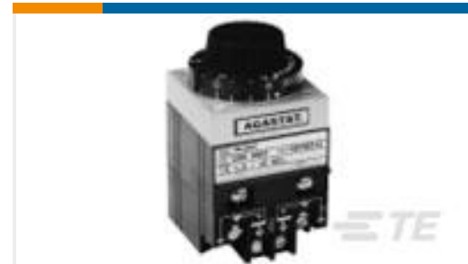
TE Part #1-1423157-2 7012AE=RLY,STD,ON,2P,120VAC,20