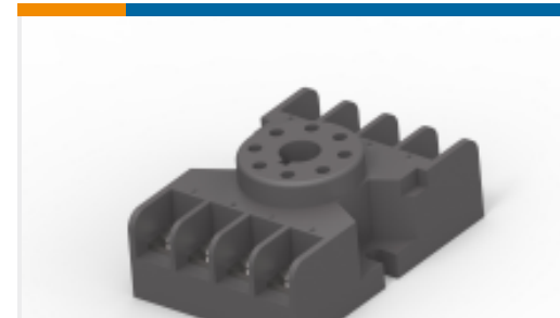
TE Part #1393143-6 27E122=SOCKET,KRP,8,SCW,PLES