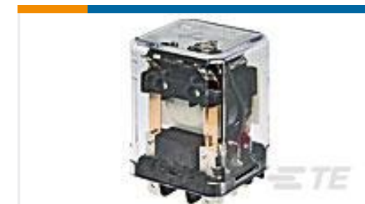
TE Part #1393114-5 KUEP-3D35-24=KU