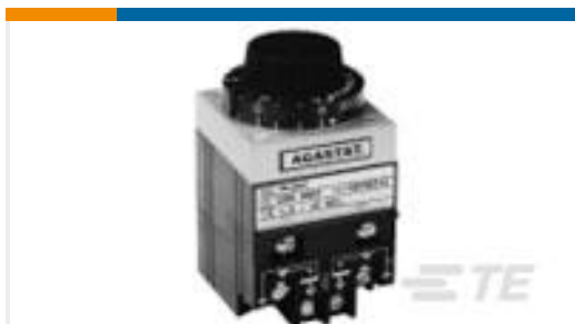
TE Part #1423157-8 7012AD=RLY,STD,ON,2P,120VAC,50