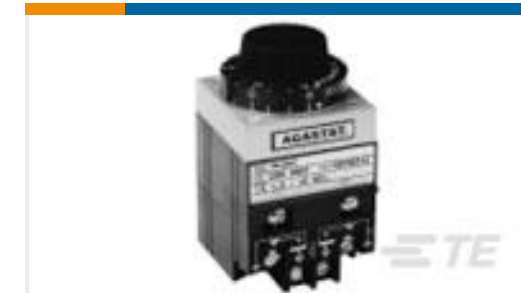
TE Part #1423157-5 7012AC=RLY,STD,ON,2P,120VAC,15