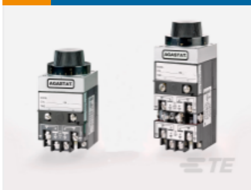
TE Part # 2-1423157-4 7012AK=RLY,STD,ON,2P,120VAC,30