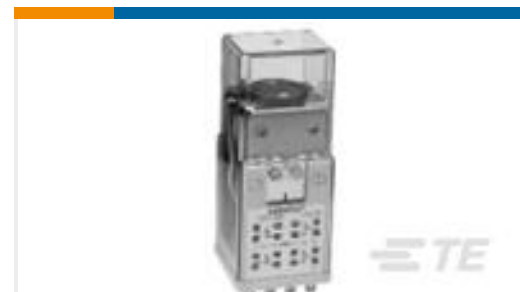
TE Part #1423155-6 GPDN=RLY,GEN,PURP,125VDC