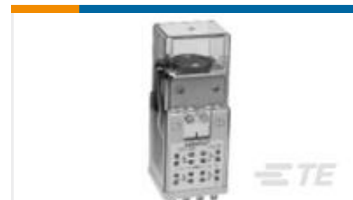
TE Part #1423156-1 GPI=RLY,120VAC