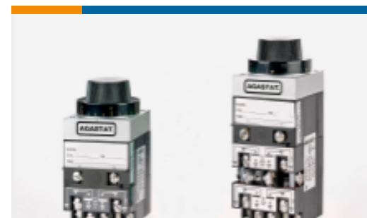
TE Part #1755170-1 7022OCIM=RLY,STD,OFF,2P,24V,15S,I, M