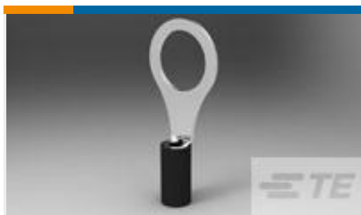
TE Part #342066 16-14 H.D.R/T 1/2" STUD BLACK