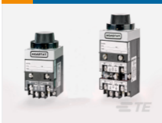
TE Part # 1423162-5 7022AC=RLY,STD,OFF,2P 120VAC,1