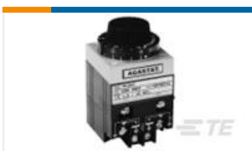
TE Part #6-1755142-4 7022WDIM=RLY,STD,OFF,2P,96V,50S,I, M