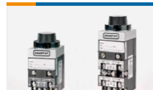
TE Part #7-1472995-0 7012WDS=RLY,STD,ON,2P,96V,50S,S