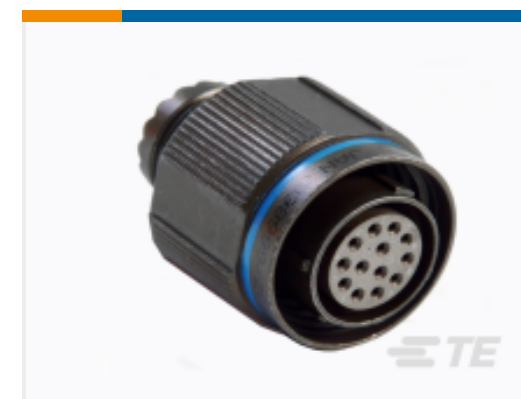
TE Part #YACT26JE35HBV00100 Straight Plug D38999, E35 Insert