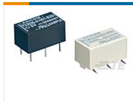
TE Part #1393776-7 V23026D1024B201 *X020