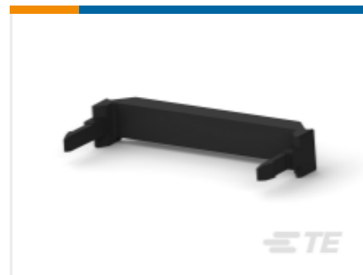
TE Part #1-499252-0 Bus Connector: Strain Relief, ATA