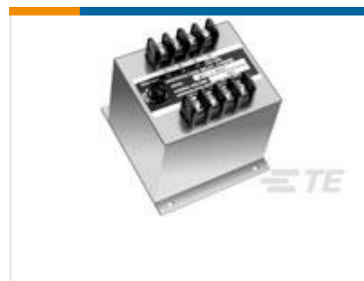
TE Part #2-1618112-2 WUV-1-120=WILMAR UNDERVOLTAGE