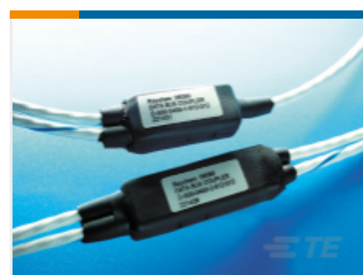
TE Part #279316-000 D-500-04-C23-072