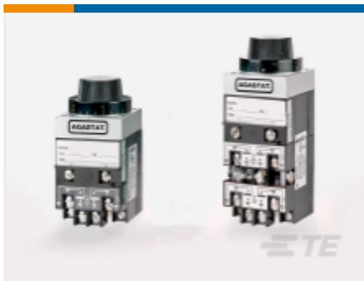
TE Part # 3-1423159-3 7012PJ=RLY,STD,ON,2P,125VDC,1