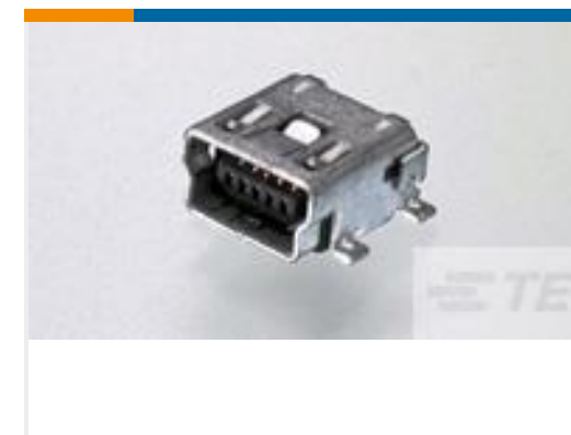
TE Part #1734035-2 MINI USB, TYPE B, R/A, SMT