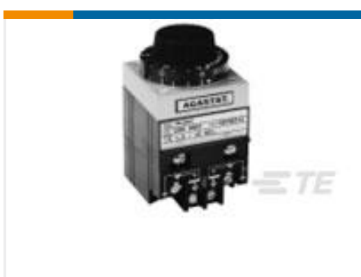
TE Part #3-1423157-4 7012BI=RLY,STD,ON,2P,240VAC,6