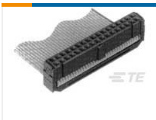
TE Part #1658622-5 24 NOVO MIL/CTR 30DP, LEAD FREE