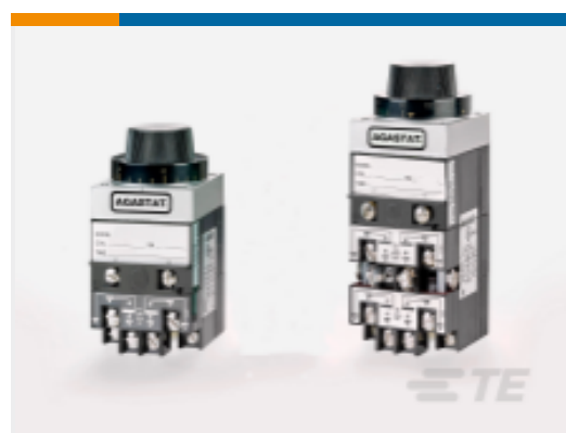
TE Part # 2-1423162-9 7022BK=RLY,STD,OFF,M2P,240VAC,