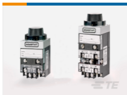
TE Part #8-1437487-6 7012ODILL=24V DC 5-50 SEC