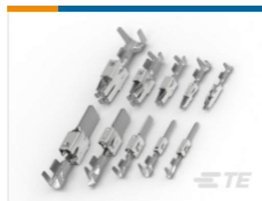
TE Part #927770-3 TIMER, RECEPTACLE AND TAB