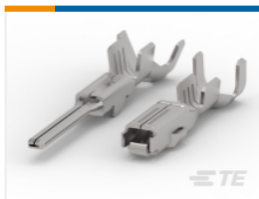
TE Part #183024-1 AMP SUPERSEAL 1.5MM, RECEPTACLE AND TAB