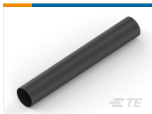
TE Part #7574442007 RAYRIM-NR8-0-STK