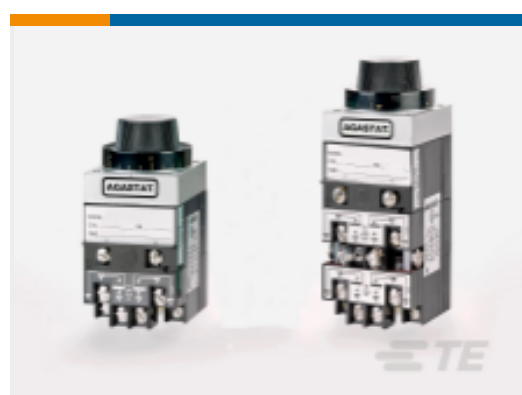
TE Part #4-1755142-8 7022RHA2I=RLY,STD,OFF,2P,60V,30M, A2,I