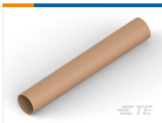
TE Part #5677604005 RNF-3000 Single Wall Spool HS Tubing