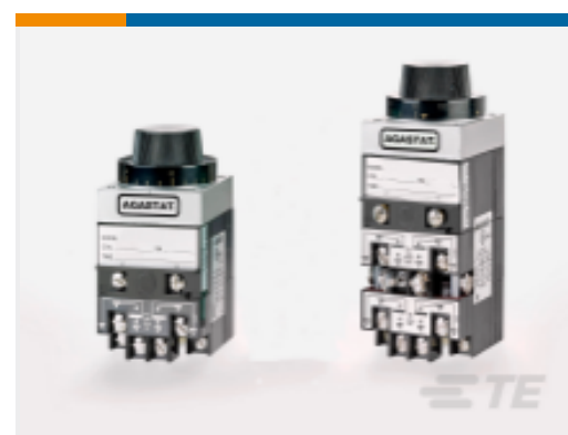
TE Part #4-1423161-8 7014RHA2I2=RLY,STD,ON,4P,60V,30M, A2,I2