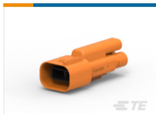
TE Part #2103191-6 CAP SUBASSY, KEY F, HVA280-2PHI