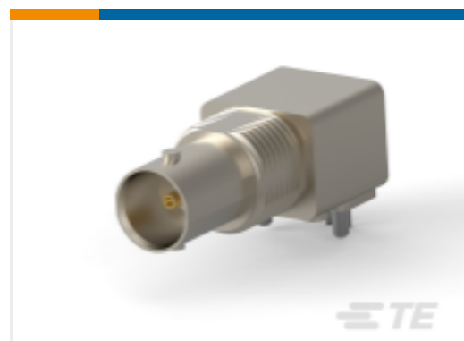
TE Part #5415105-2 BNC RF Connector: Male (Jack), Right-angle, 75 Ohm