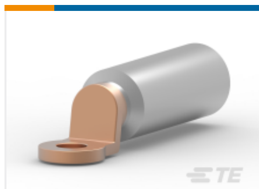
TE Part #1306957-1 Bimetallic Compression Cable Lugs