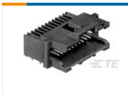
TE Part #104477-8 12 SYSTEM 50 HDR DRRRA SHRD