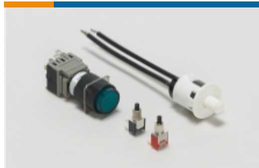
Push Button Switches(29)