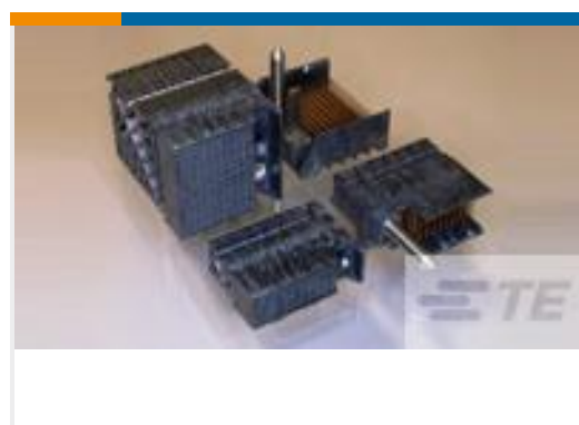
TE Part #2007832-2 IMP100S,H,V4P16C,UG,OEW46,4.9