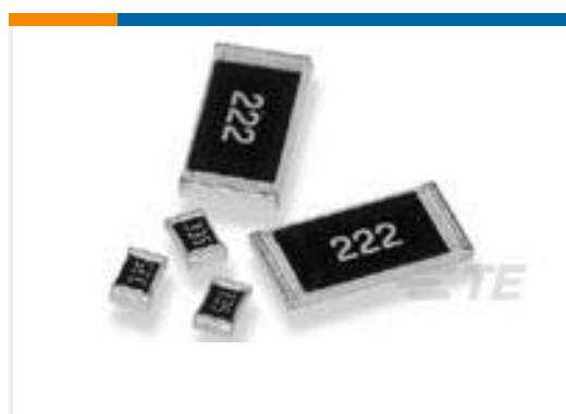
TE Part #8-1879536-5 CRGV2010 1% 383K 3000V