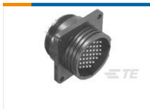
TE Part #208132-1 CPC RECPT ASSEMBLY SIZE 23-37