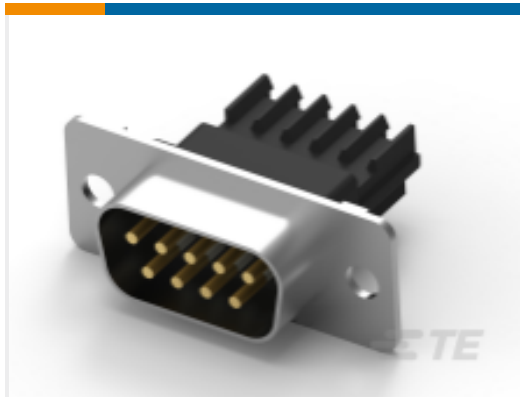
TE Part #1-745492-9 IDC D-Sub: Plug Assembly, Wire to Wire, Signal, 2.77 mm