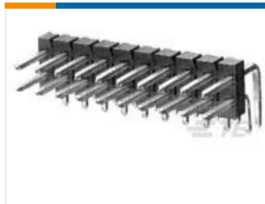
TE Part #103149-8 16 MODII HDR DRRA B/A .100CL