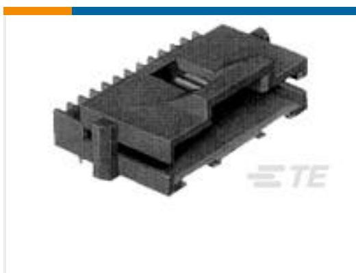
TE Part #104074-5 25 SYSTEM 50 HDR SRRA SHRD