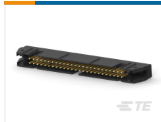
TE Part #1-5102156-1 AMP-LATCH UNIVERSAL HEADERS