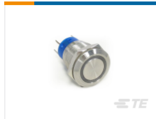
TE Part #1-2213764-5 AV19 SPM 5A FIX RING LED GREEN 24V