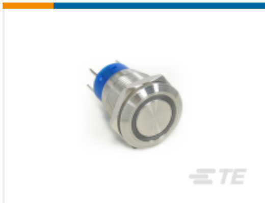
TE Part #1-2213764-9 AV19 SPM 5A FIX RING LED BLUE 24V