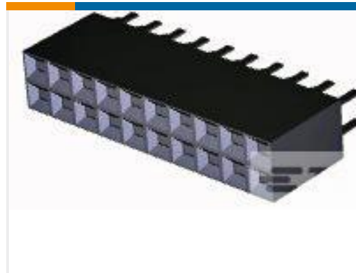
TE Part #1-534998-0 20 MODIV VRT DR CE 100/125