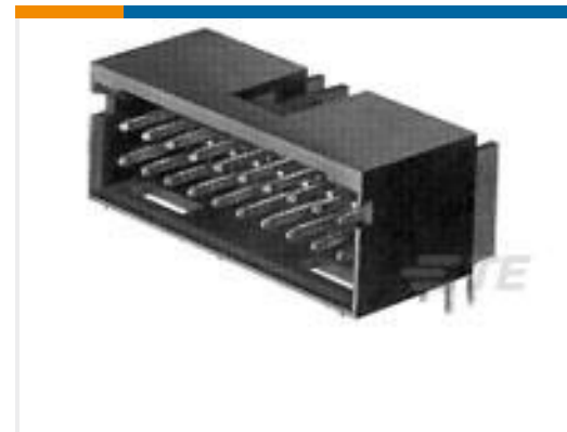
TE Part #2-102617-3 50 MODII HDR DRRA SHRD .100CL